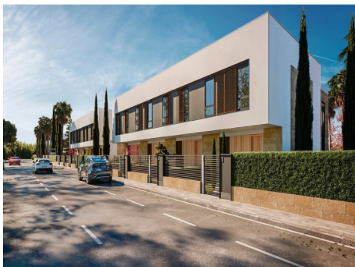
Close to Alcudia city center