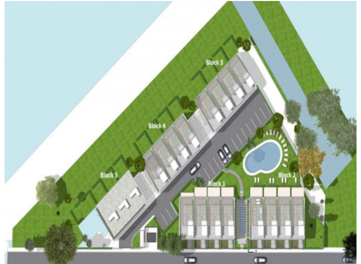
Plan of the community

All information is correct to the best of our knowledge. Errors and prior sale excepted. This prospectus is purely for information purposes. Only the notarized deed of sale is legally binding.