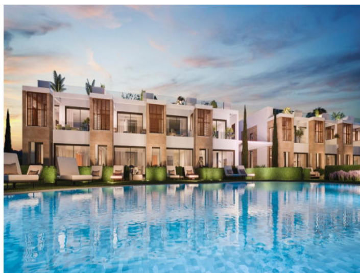
Large community pool