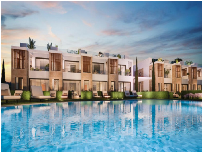
Large community pool o