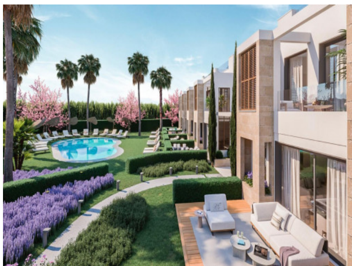
Private garden and community pool