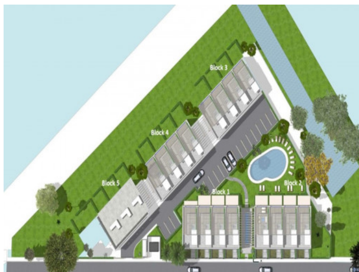
Plan of the community

All information is correct to the best of our knowledge. Errors and prior sale excepted. This prospectus is purely for information purposes. Only the notarized deed of sale is legally binding.