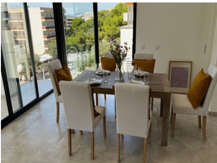
Lovely dining area