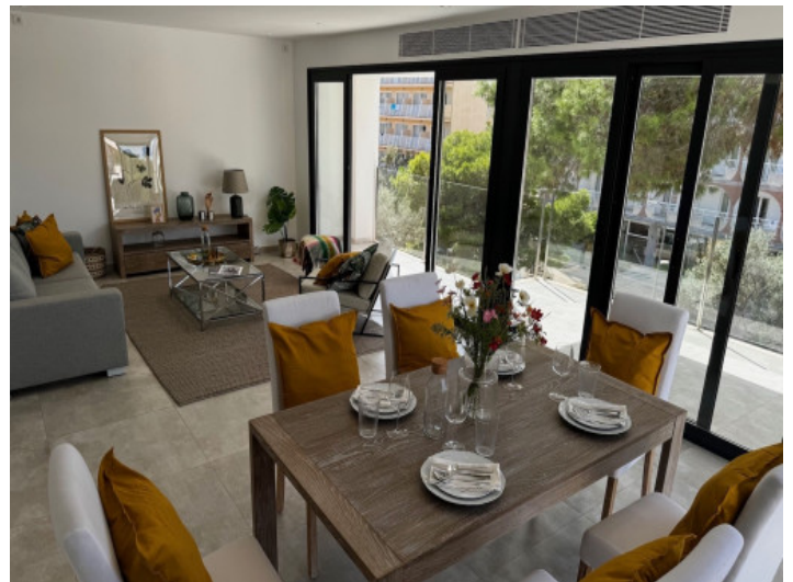
Light-flooded living and dining area