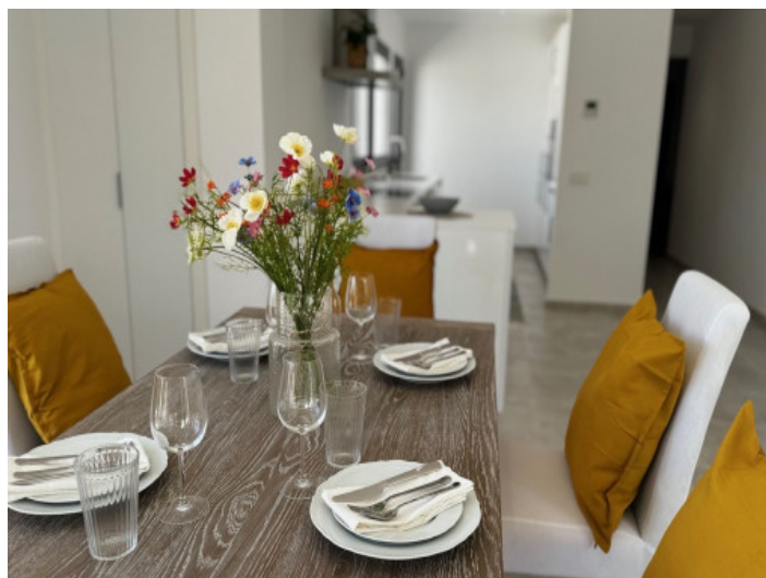
Dining area adjoining the kitchen

All information is correct to the best of our knowledge. Errors and prior sale excepted. This prospectus is purely for information purposes. Only the notarized deed of sale is legally binding.