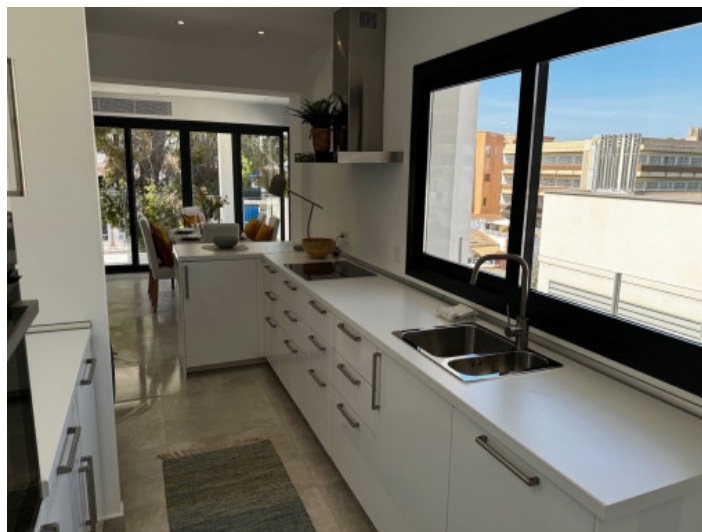
Fully fitted kitchen