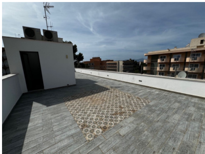
Fantastic roof terrace