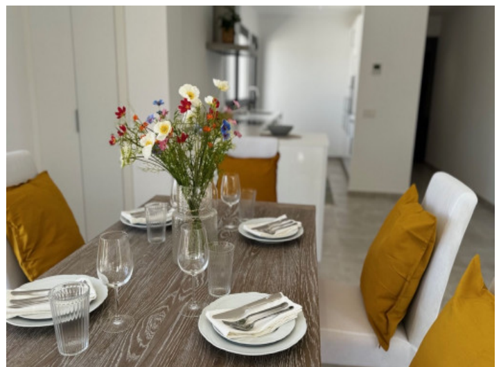
Dining area adjoining the kitchen

All information is correct to the best of our knowledge. Errors and prior sale excepted. This prospectus is purely for information purposes. Only the notarized deed of sale is legally binding.