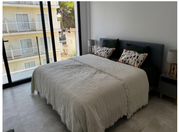
Spacious double bedroom