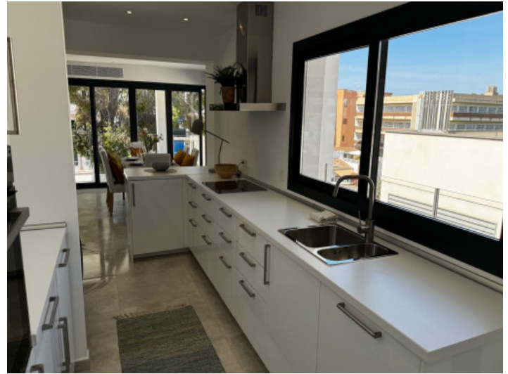
Fully fitted kitchen