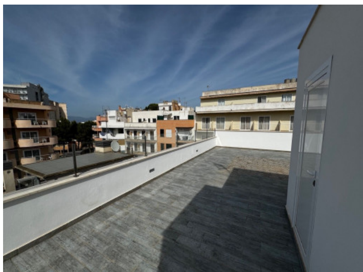
Additional view of the roof terrace