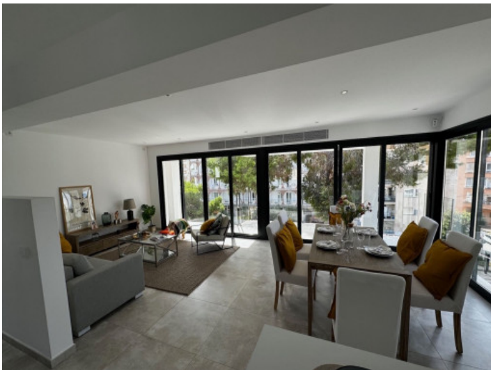
Open plan living area