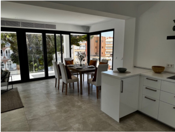
Modern kitchen and dining area