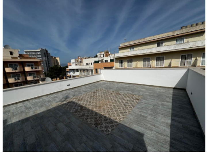
Large roof terrace