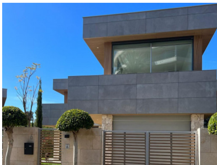
Villa with 4 bedrooms

All information is correct to the best of our knowledge. Errors and prior sale excepted. This prospectus is purely for information purposes. Only the notarized deed of sale is legally binding.