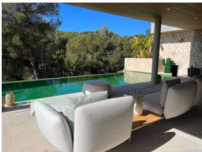
Beautiful outdoor areas