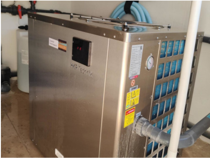
Engine room air conditioning