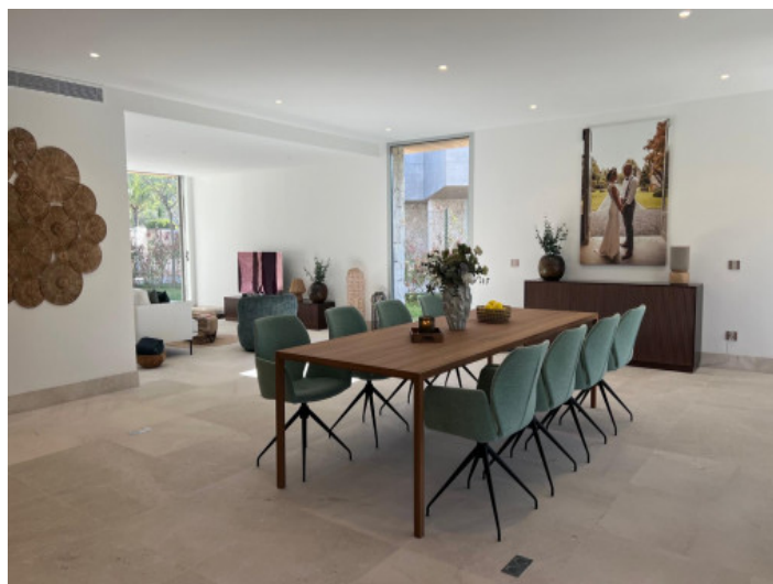
Large dining area

All information is correct to the best of our knowledge. Errors and prior sale excepted. This prospectus is purely for information purposes. Only the notarized deed of sale is legally binding.