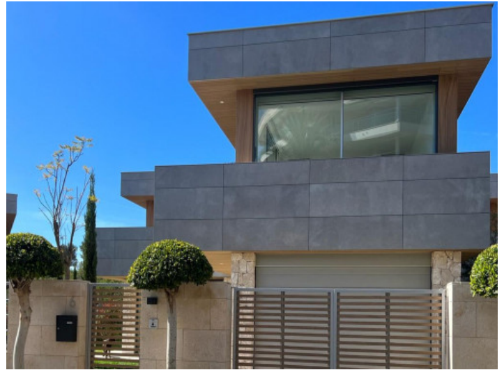
Villa with 4 bedrooms

All information is correct to the best of our knowledge. Errors and prior sale excepted. This prospectus is purely for information purposes. Only the notarized deed of sale is legally binding.