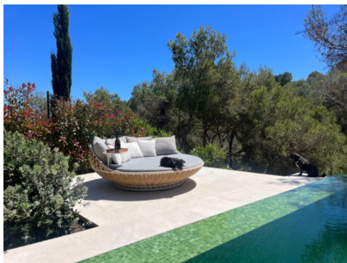
Relaxing pool area