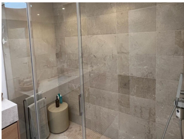
Shower with natural stone tiles