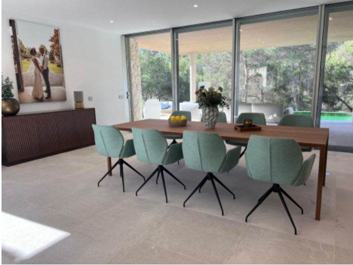
Dining area with lots of daylight