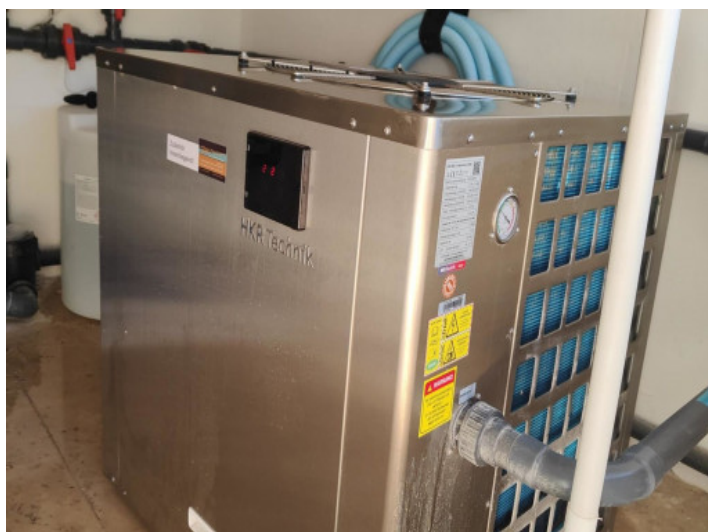
Engine room air conditioning