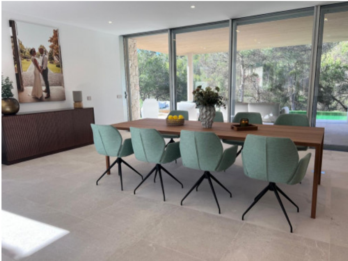
Dining area with lots of daylight