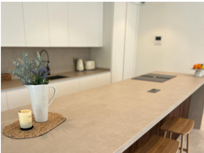
Large kitchen with cooking island