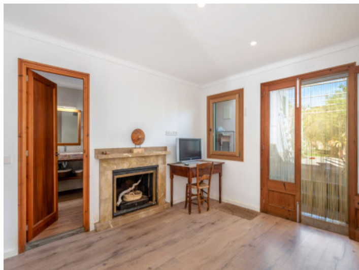
Bathroom on the ground floor