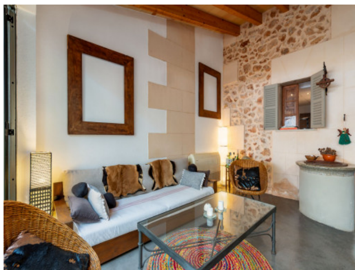
Inviting living area