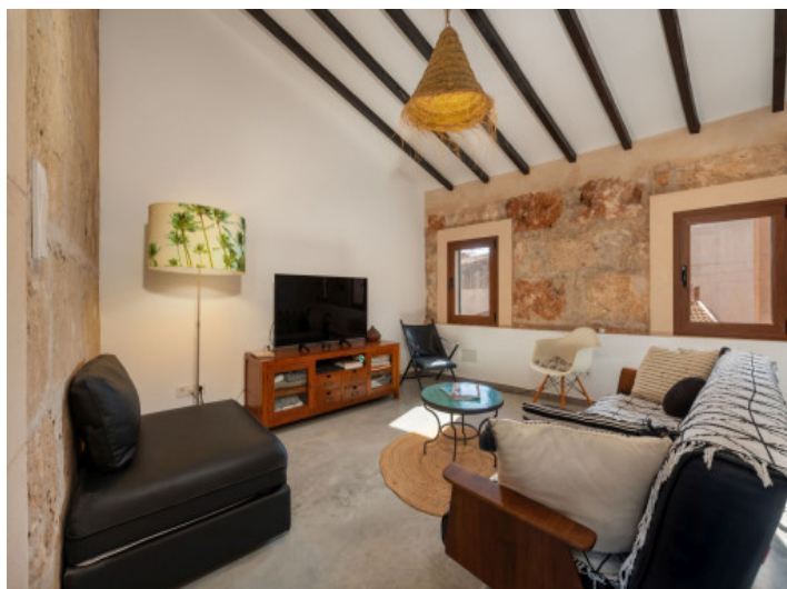
Additional living area