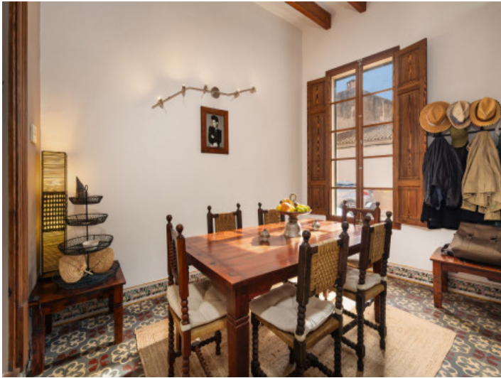
Light-flooded dining area