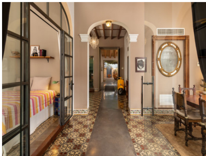
Magnificent entrance area