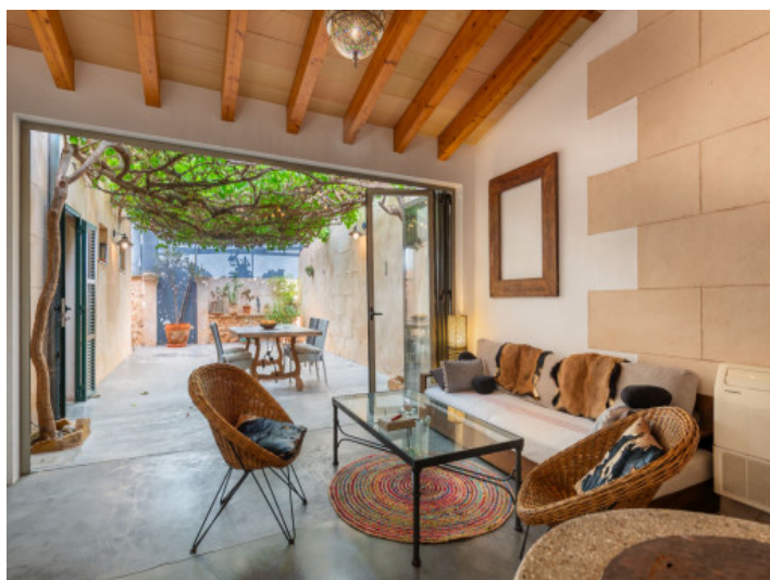
Living area with access to the patio