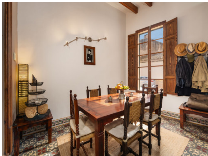
Light-flooded dining area