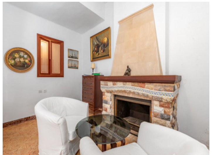
Living room with fireplace

All information is correct to the best of our knowledge. Errors and prior sale excepted. This prospectus is purely for information purposes. Only the notarized deed of sale is legally binding.