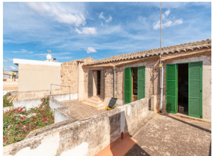
Terrace first floor

All information is correct to the best of our knowledge. Errors and prior sale excepted. This prospectus is purely for information purposes. Only the notarized deed of sale is legally binding.