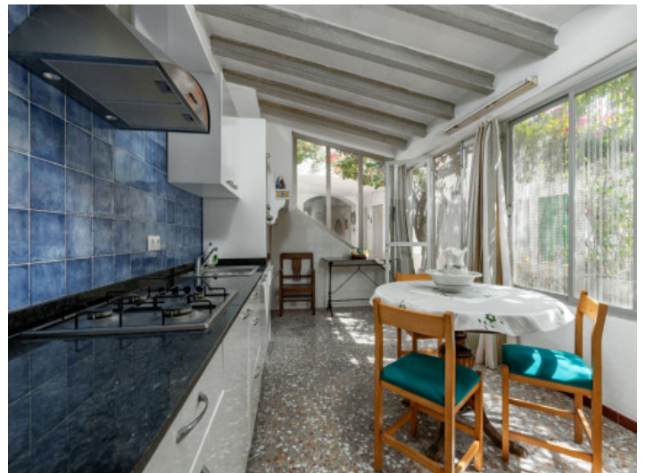
Kitchen close to the patio