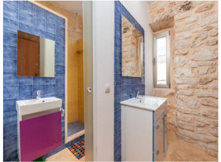
One of 3 bathrooms