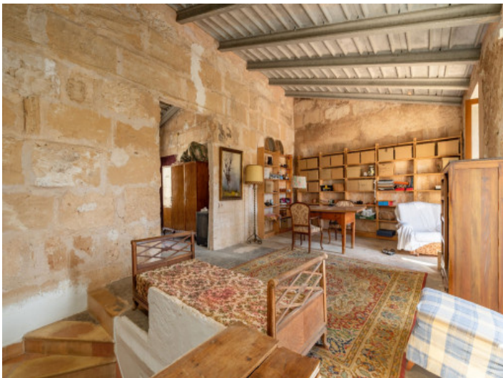
Hall first floor