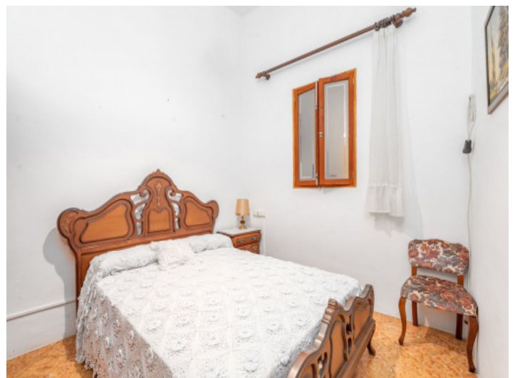
One of 4 bedrooms

All information is correct to the best of our knowledge. Errors and prior sale excepted. This prospectus is purely for information purposes. Only the notarized deed of sale is legally binding.