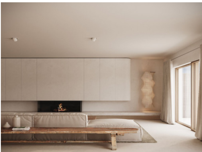
Living area with fireplace