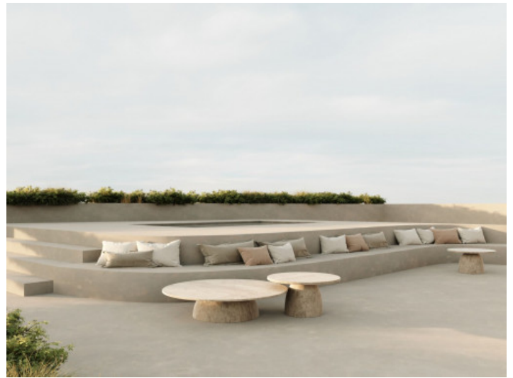
Relax close to the jacuzzi on the rooftop