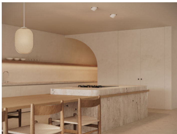
Nice cooking island