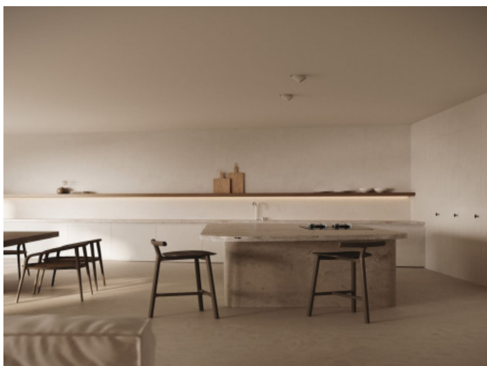
Stylish kitchen with