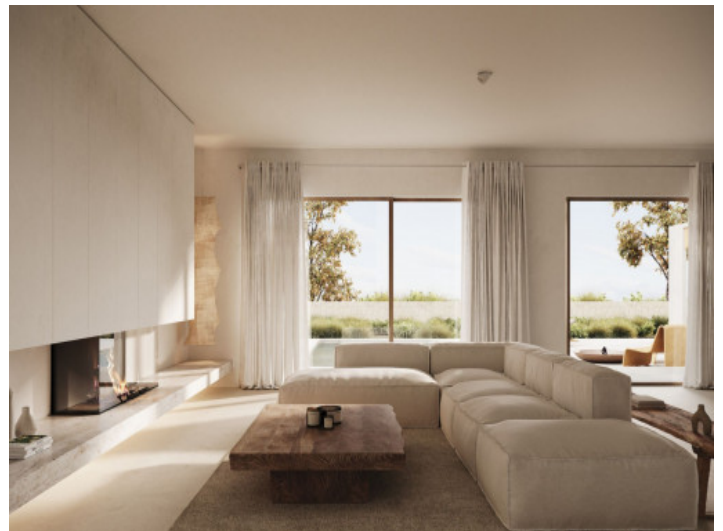
Bright living area