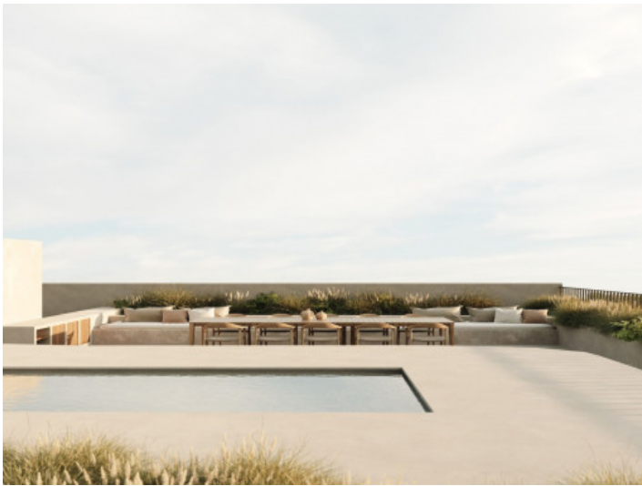
Beautiful Pool in the patio