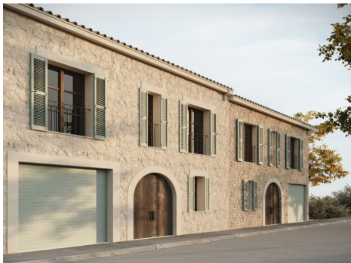
Exclusive new-build townhouse with pool and roof terrace in Ses Salines