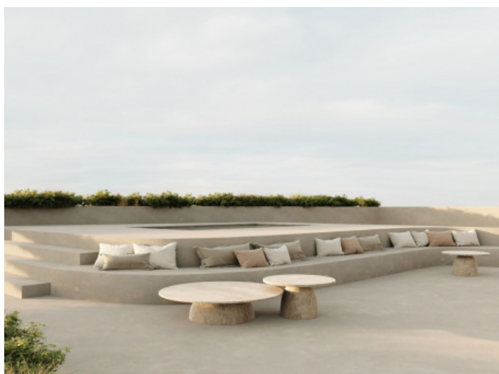
Sitting area close to the jacuzzi on the rooftop