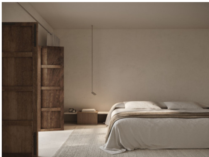
Townhouse with 3 bedrooms