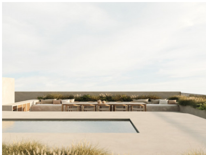
Pool area in the patio