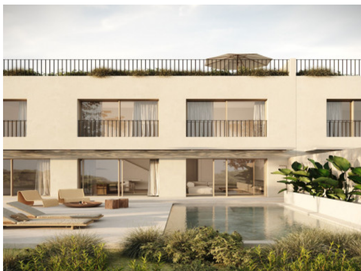
Beautiful townhouse with garden and pool