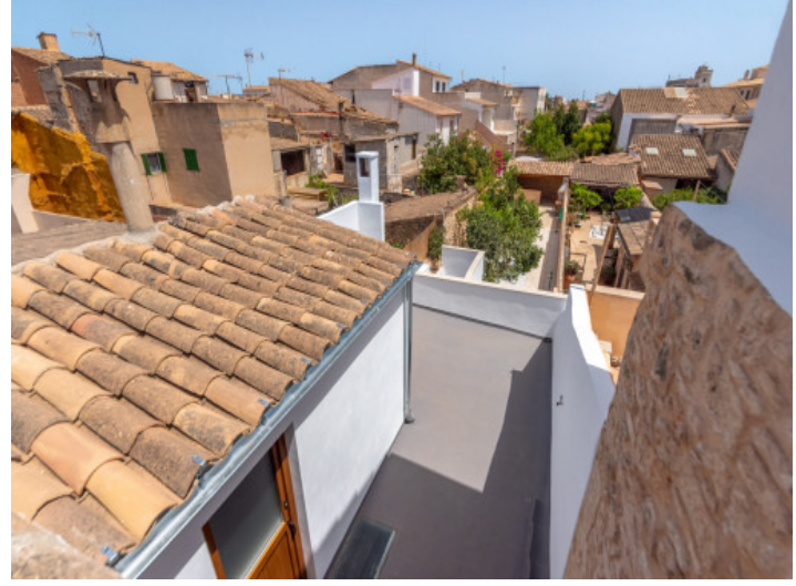
View from the topfloor ovver the neighborhood