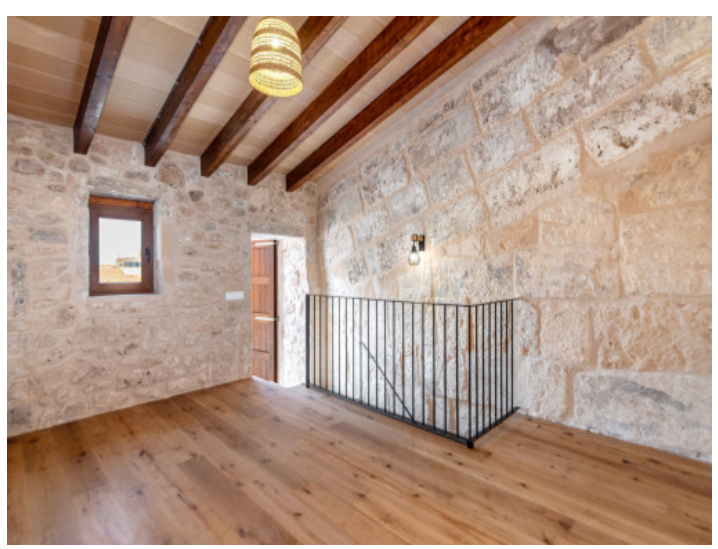
Natural stone walls