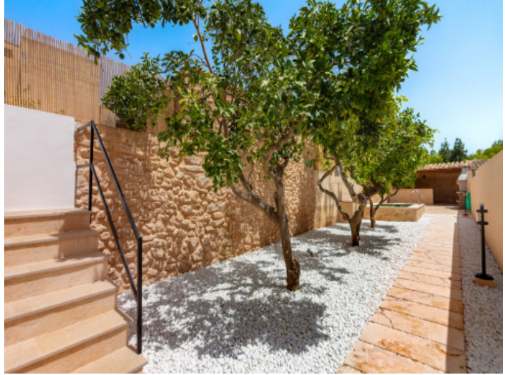
BBQ area Lovely patio All information is correct to the best of our knowledge. Errors and prior sale excepted. This prospectus is purely for information purposes. Only the notarized deed of sale is legally binding.

PORTA MALLORQUINA • C./ CONQUISTADOR 8, 07001 PALMA TEL. +34 971 698 242 • INFO@PORTAMALLORQUINA.COM