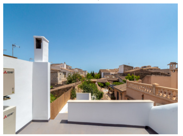
Rooftop terrace with views