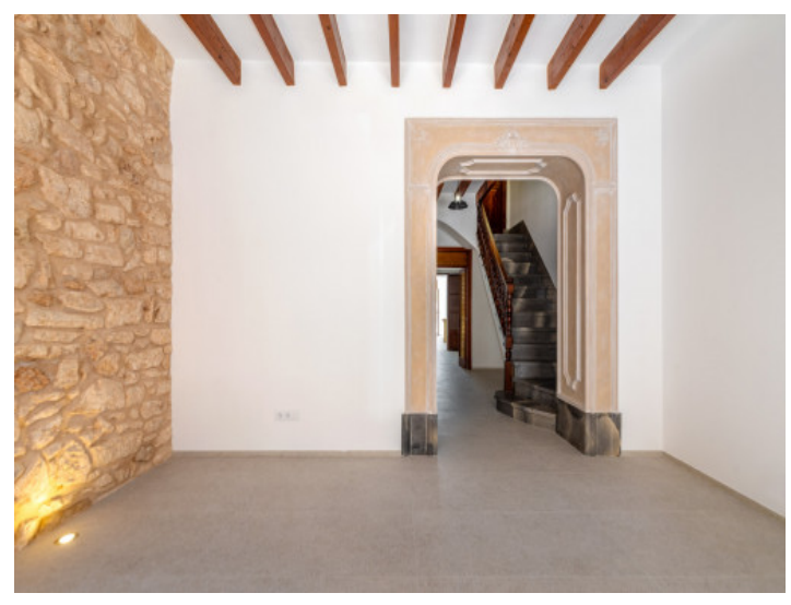
Living area and staircase to the first floor