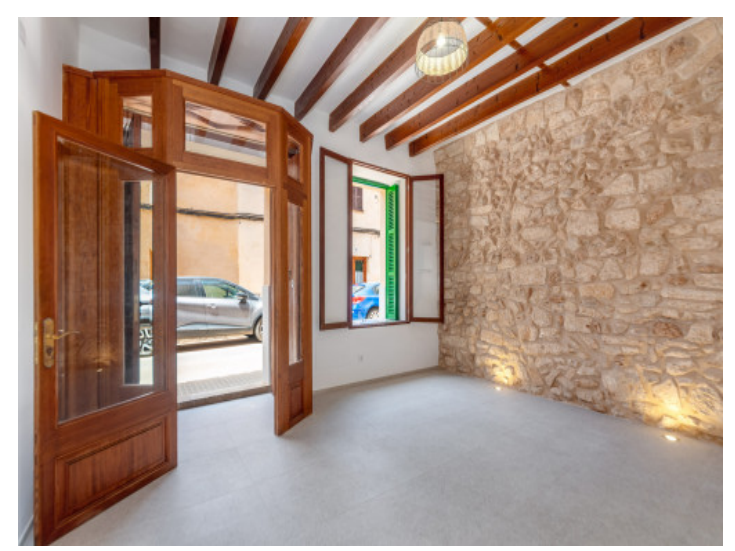
Typical entrance to a Mallorcan village house