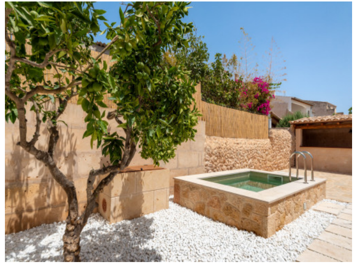
Patio with pool

PORTA MALLORQUINA® Your home. Our passion.