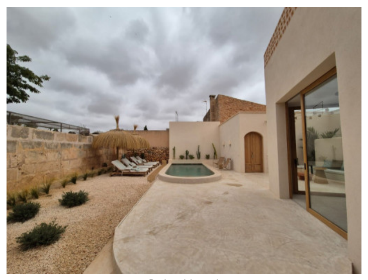
Patio with pool