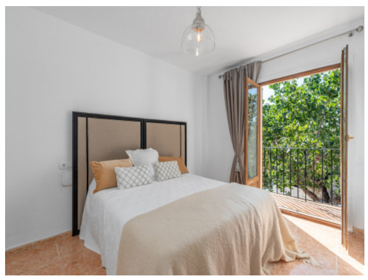
One of 3 bedroomso