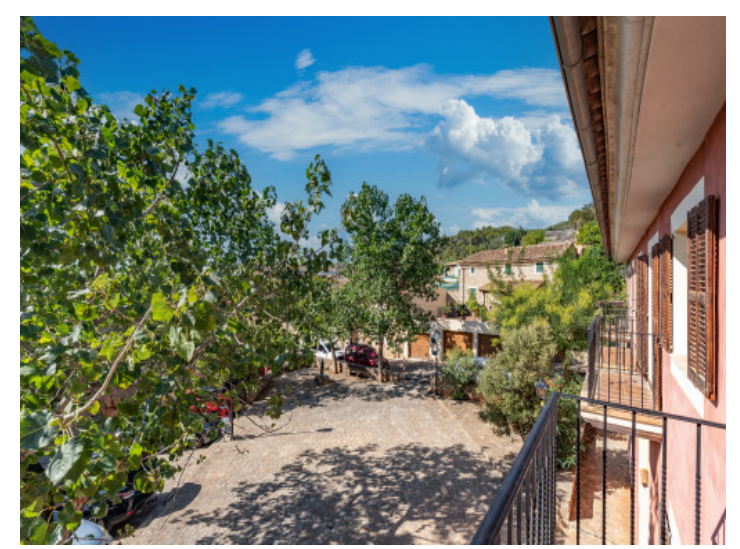
Views from the first floor