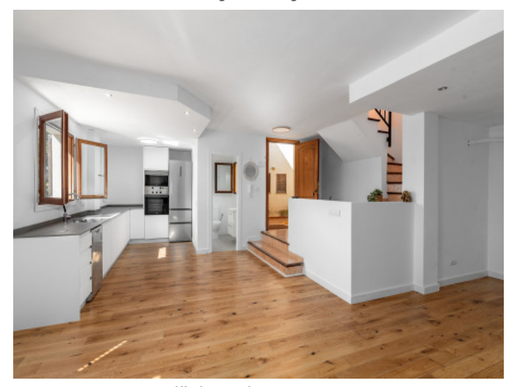
Kitchen and entrance area