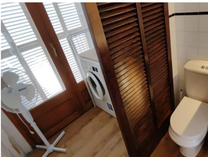
Bathroom and storage room