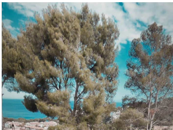
Mediterranean sea views