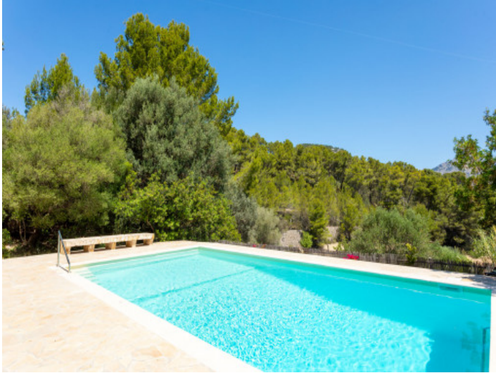
Quiet detached family home with potential in Es Capdellà