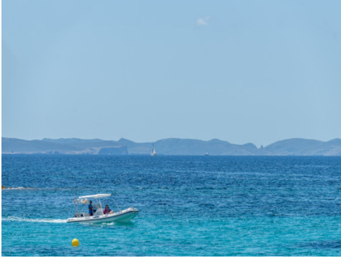
Views to Cabrera from the beach