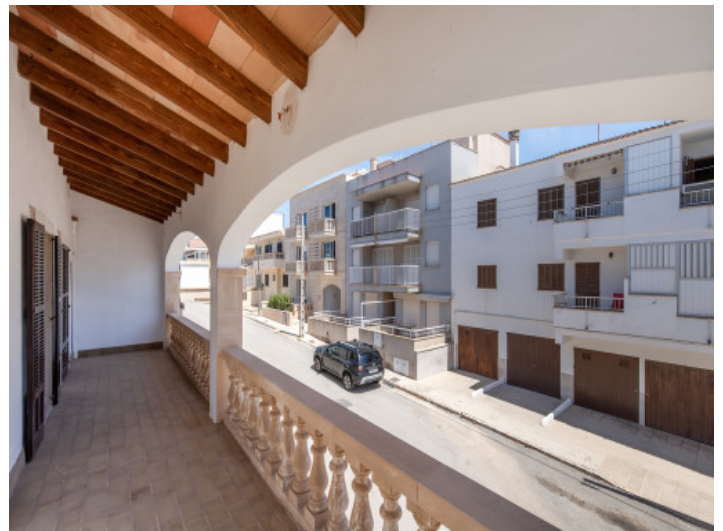
Views over the neighborhood