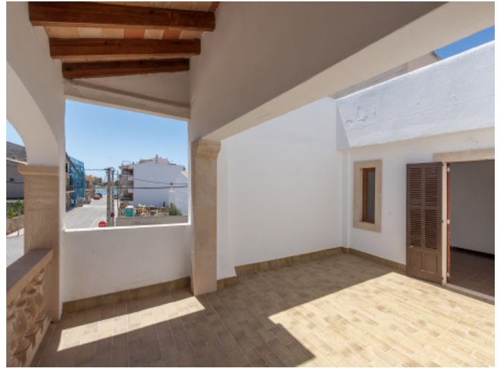
Lateral sea view