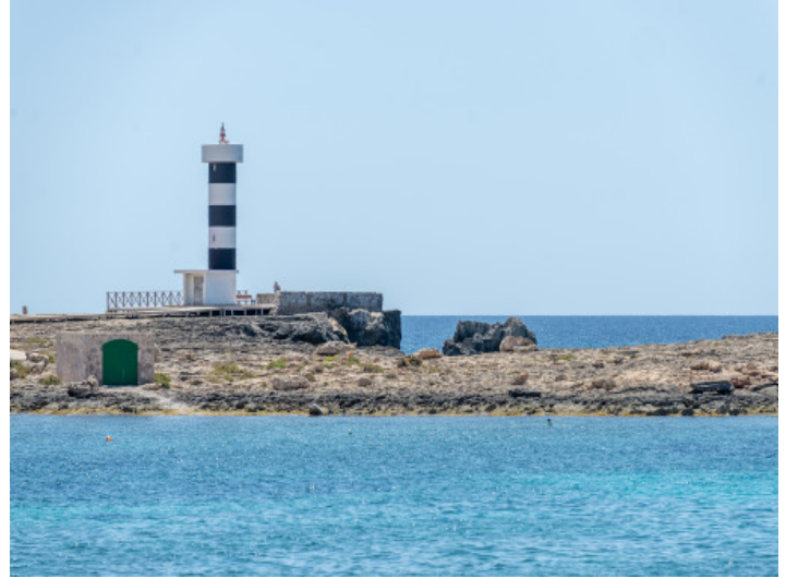
Lighthouse of Cala Gaviota