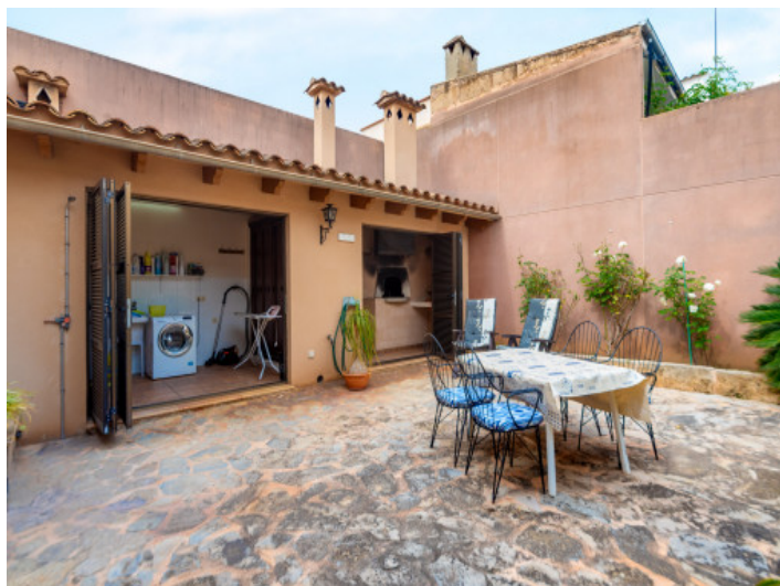
Patio and laundry room

All information is correct to the best of our knowledge. Errors and prior sale excepted. This prospectus is purely for information purposes. Only the notarized deed of sale is legally binding.