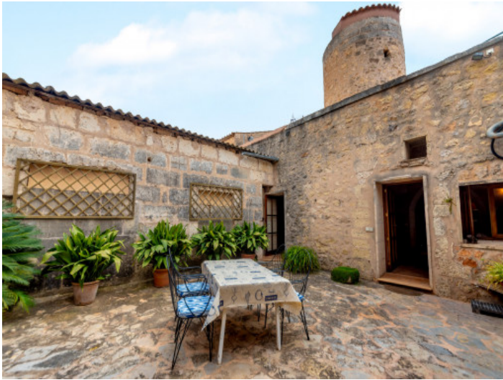
Traditional townhaus large patio en Manacor