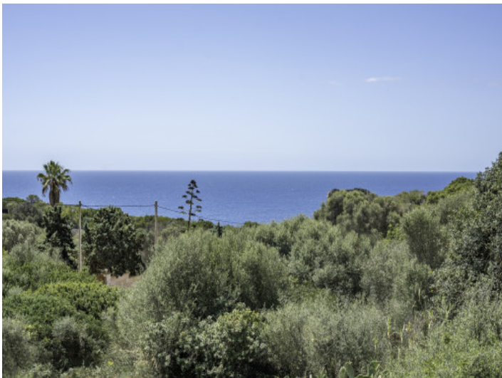
Mediterran sea views