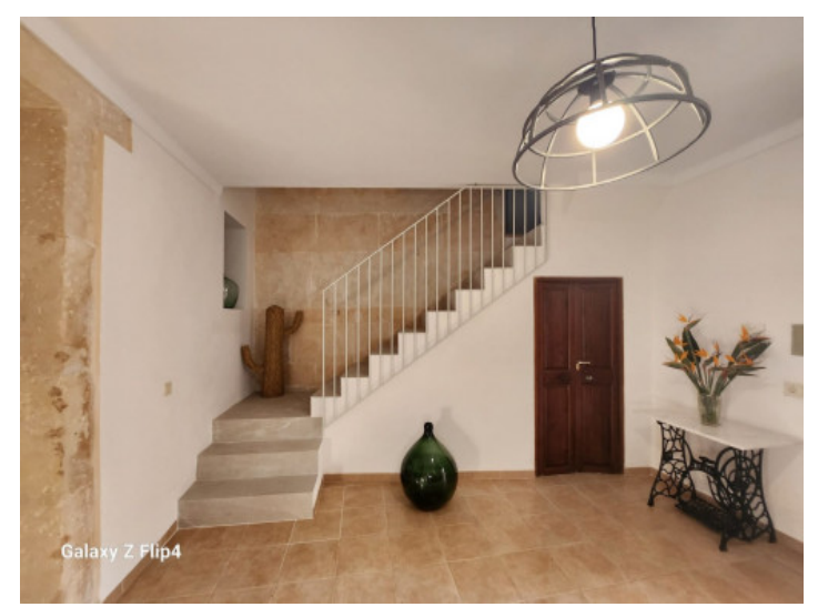
Adaxy z Fip4