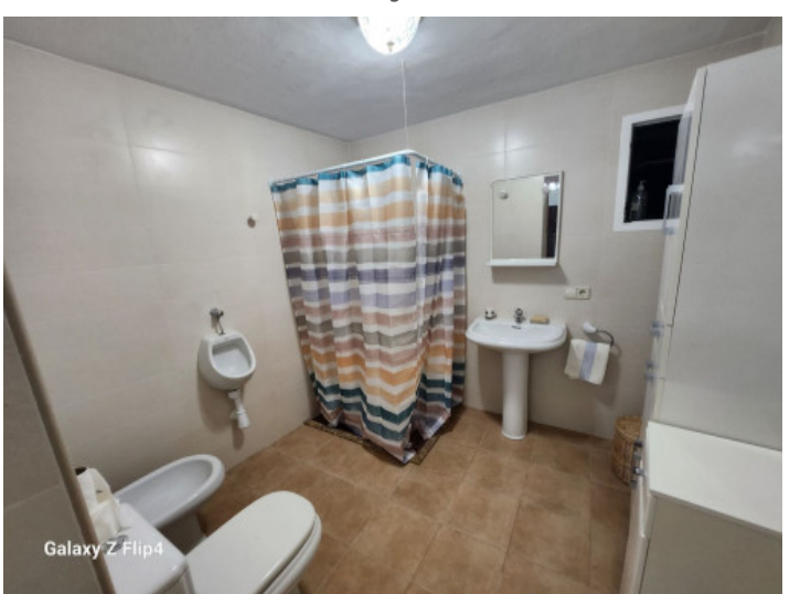
Bathroom Bedroom All information is correct to the best of our knowledge. Errors and prior sale excepted. This prospectus is purely for information purposes. Only the notarized deed of sale is legally binding.