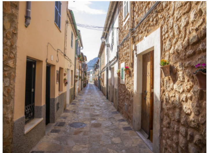
Picturesque street in the village

All information is correct to the best of our knowledge. Errors and prior sale excepted. This prospectus is purely for information purposes. Only the notarized deed of sale is legally binding.