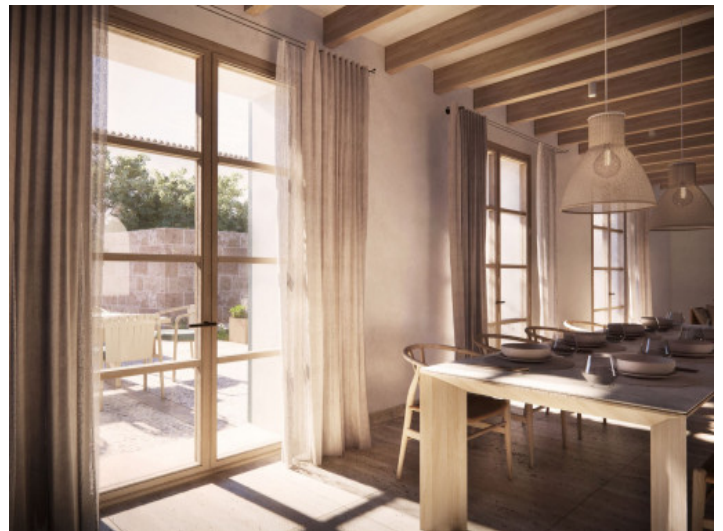
Direct terrace access