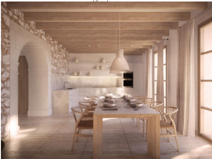
Dining area and kitchen