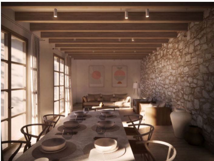
Dining and living area