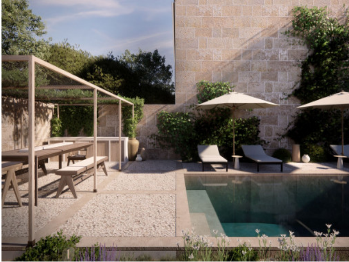
Town-house project with large garden, pool, garage and views in Lloret De