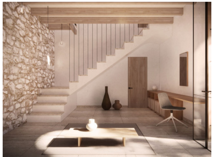
Hall with access to the upper level

All information is correct to the best of our knowledge. Errors and prior sale excepted. This prospectus is purely for information purposes. Only the notarized deed of sale is legally binding.