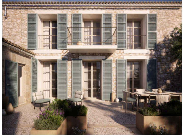
Fachade and terrace