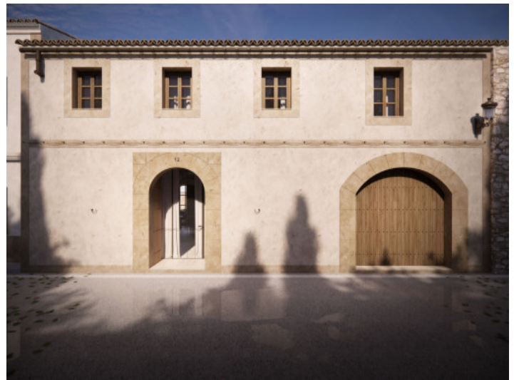
View from the street