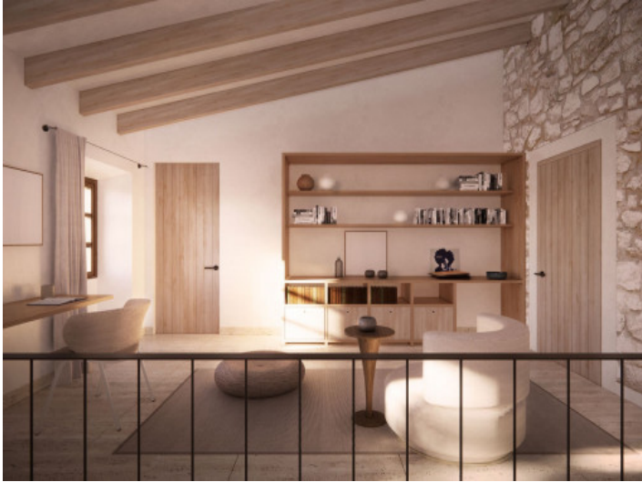
Lounge area on the upper level