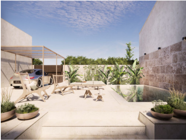
Pool area with sun terrace