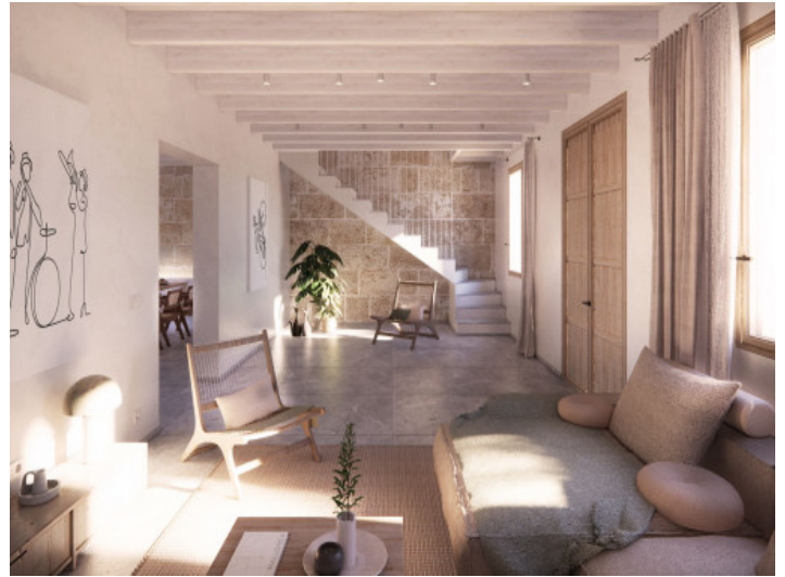
Hall with living area