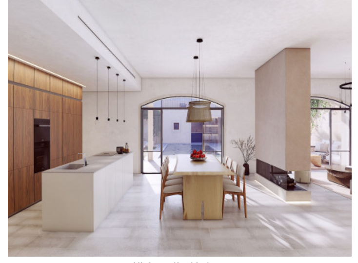
High quality kitchen