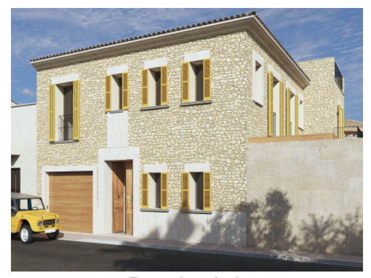
The natural stone facade