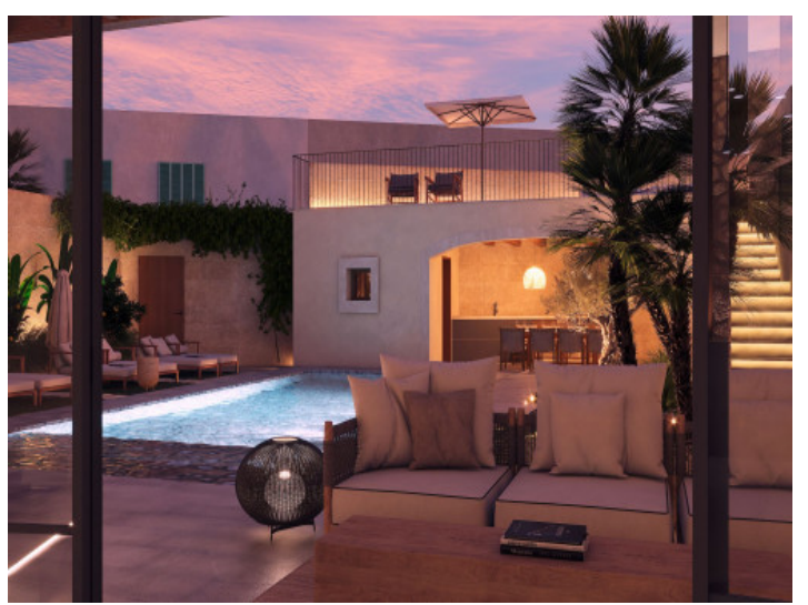
Mallorquin tradition meets modern architecture