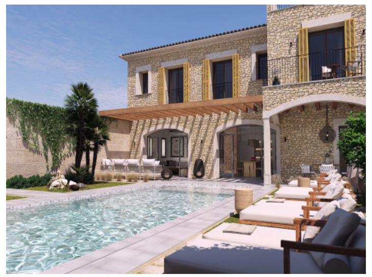
10x4m large Pool