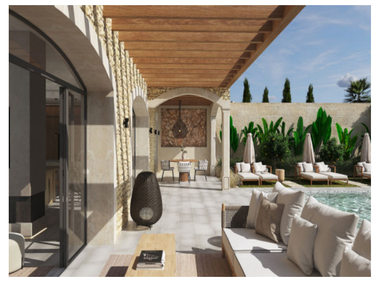
Covered terrace close to the pool