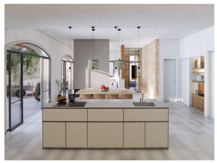
Amazing cook island