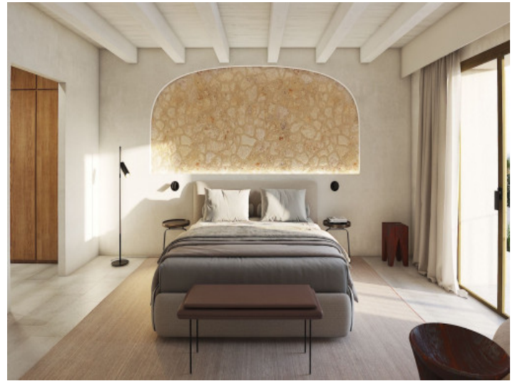
All bedrooms with bath en suite