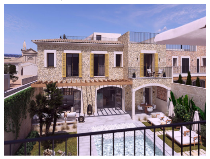
Top location in Ses Salines