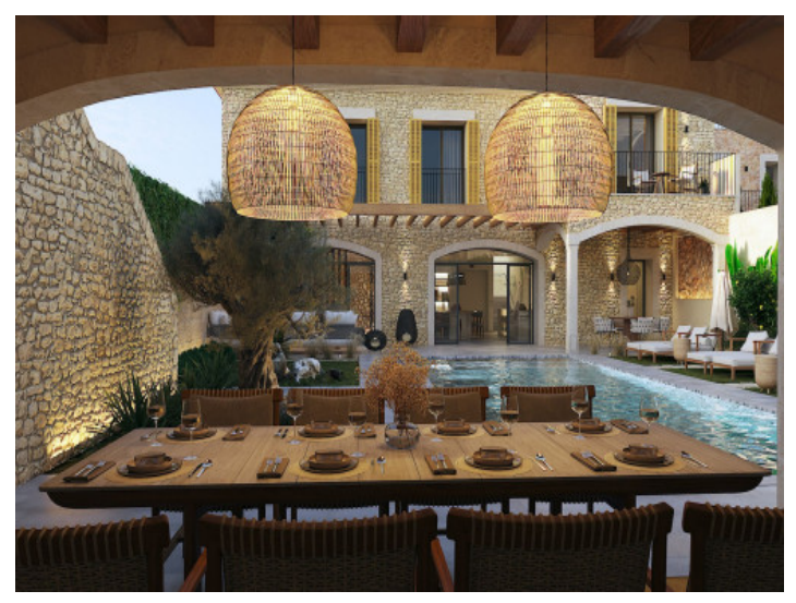
Amazing outdoor area