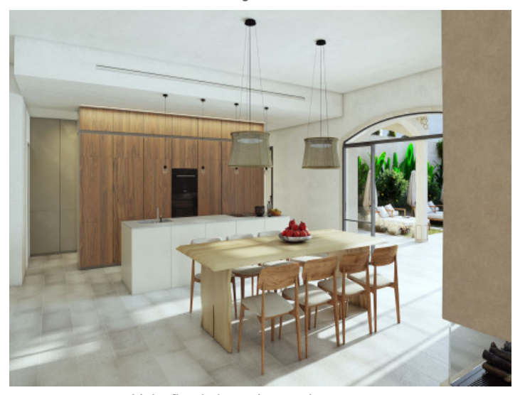
Light-flooded, spacious and open rooms