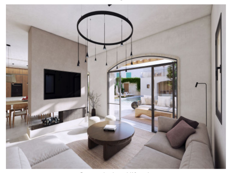
Cozy and relaxed lifestyle