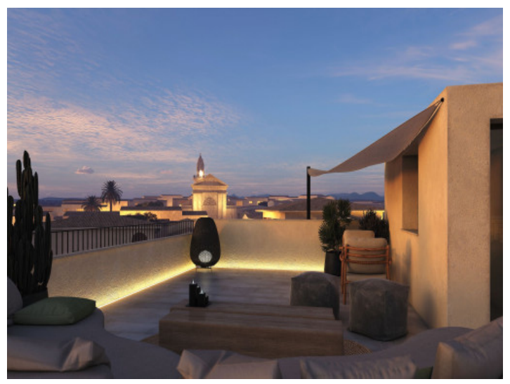
Rooftop terrace with views over the village