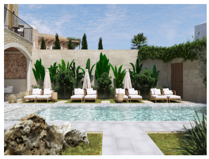
Large pool and garden