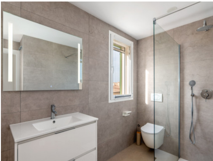
Bathroom en suite with shower