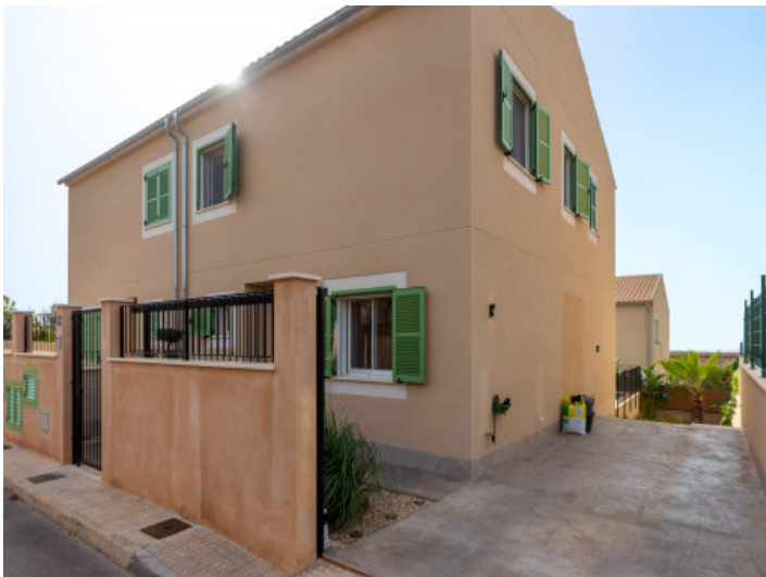
Space for 2 cars on the plot