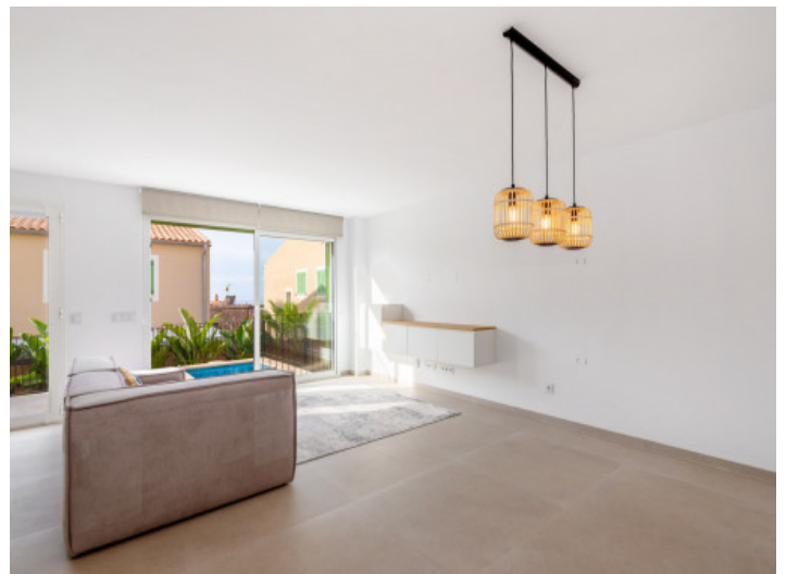
Nice stone tiles in every room

All information is correct to the best of our knowledge. Errors and prior sale excepted. This prospectus is purely for information purposes. Only the notarized deed of sale is legally binding.