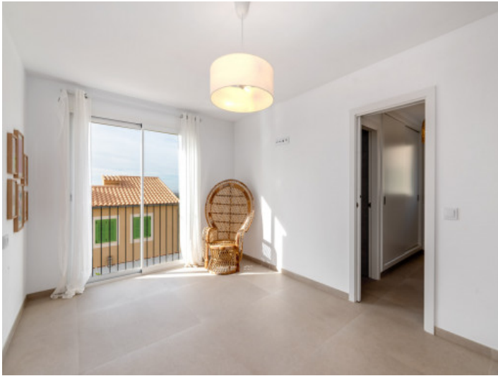
Masterbedroom with bath en suite