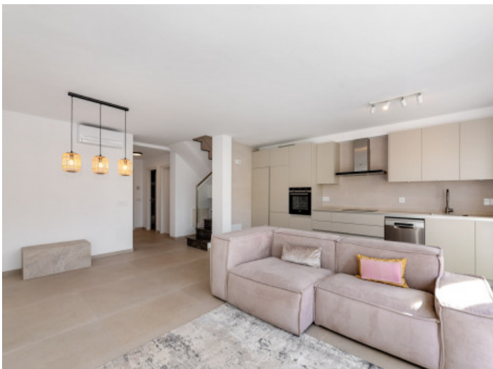
Great family house