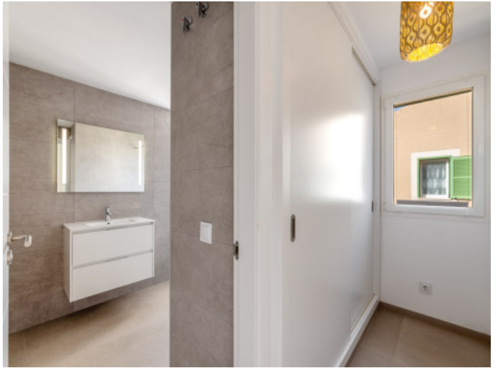
Bath en suite and fitting room