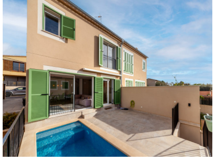
Nice outdoor patio with pool