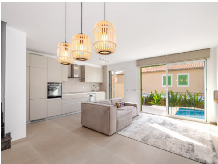
Modern kitchen and bright living and dining area