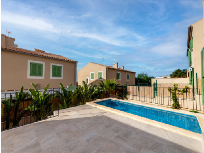
Fenced patio with pool