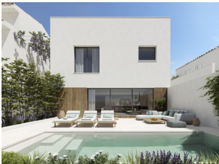
View to the house