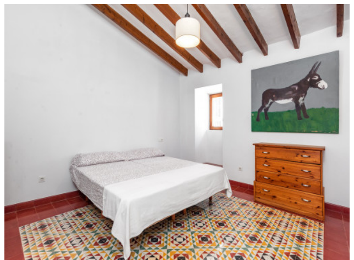
Bedroom with lots of character

All information is correct to the best of our knowledge. Errors and prior sale excepted. This prospectus is purely for information purposes. Only the notarized deed of sale is legally binding.