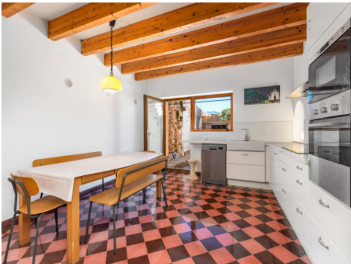
Further access to the outdoor area