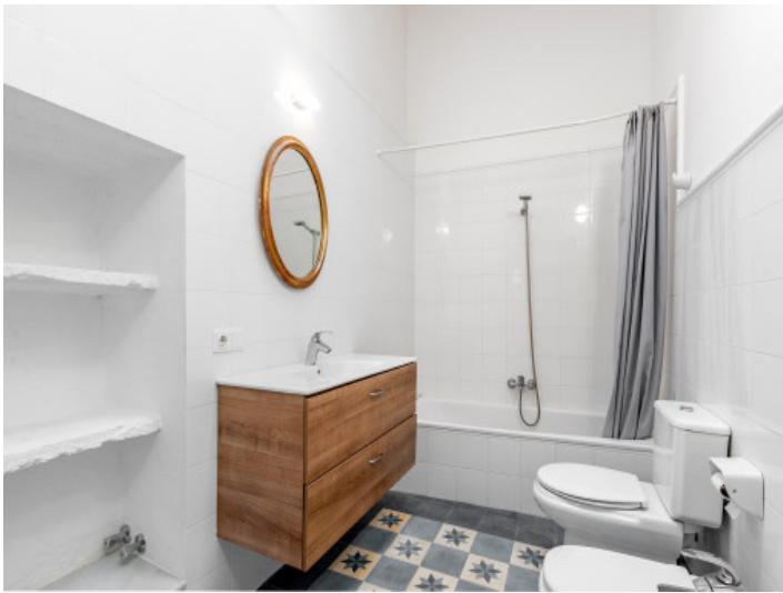
One of 2 bathrooma