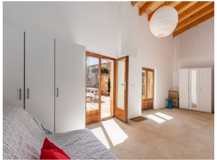
Separate guest room with access from the patio