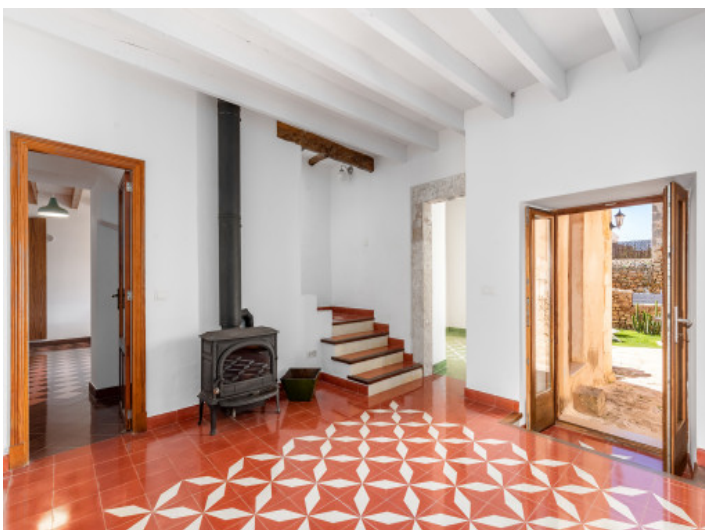
Access to the outside and stairs to the upper floor