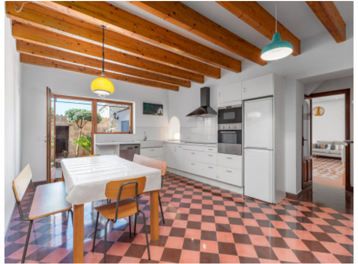
Modern kitchen and dining area