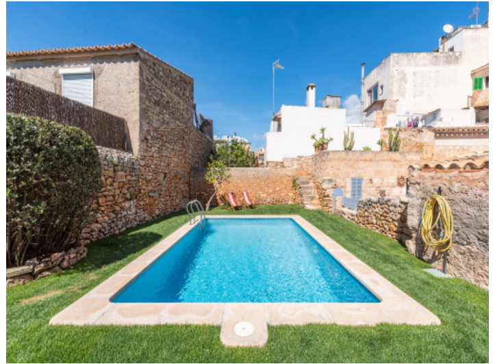
Enchanting and fenced in pool area