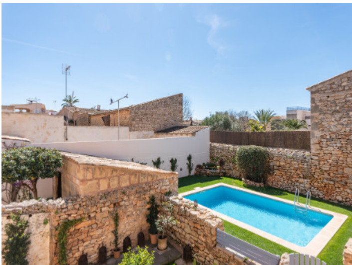
View from the upper terrace