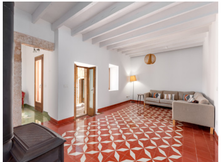
Large living area with terrace access