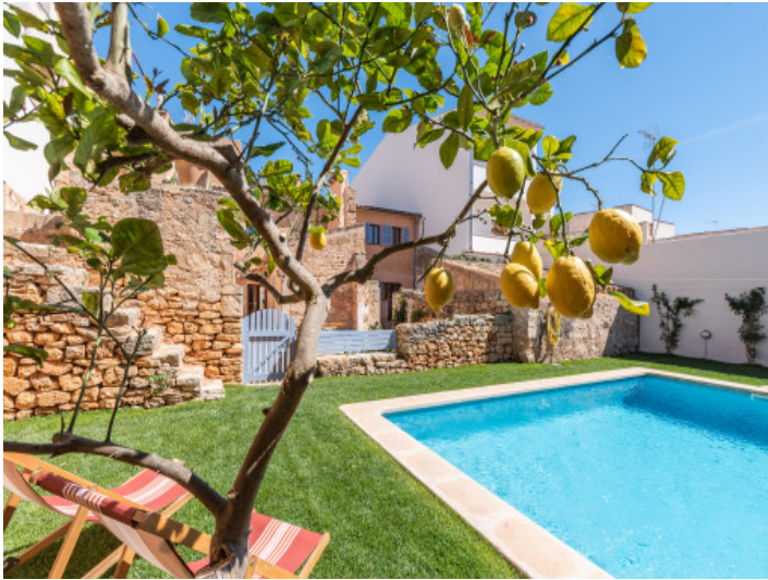
Wonderfully laid-out garden with pool