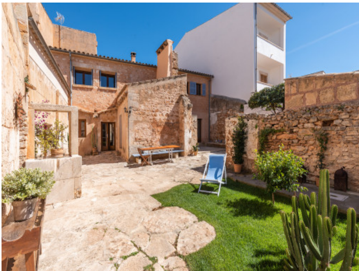
Lovely patio with garden and terraces