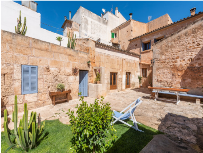
Patio and small garden