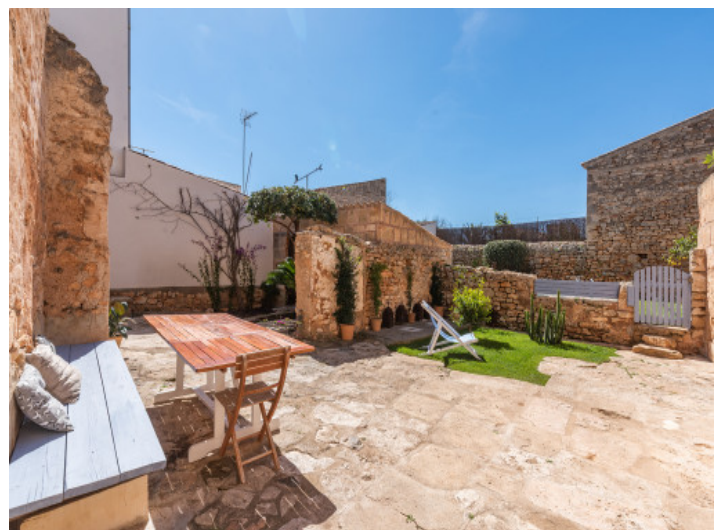
Spacious patio with outdoor dining area

All information is correct to the best of our knowledge. Errors and prior sale excepted. This prospectus is purely for information purposes. Only the notarized deed of sale is legally binding.