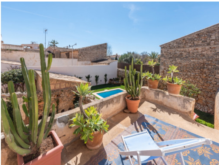
View from the upper sun terrace