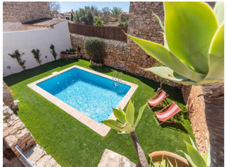
View to the beautiful pool area