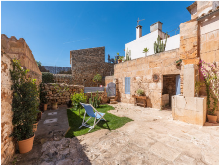
Access to the pool and garden area