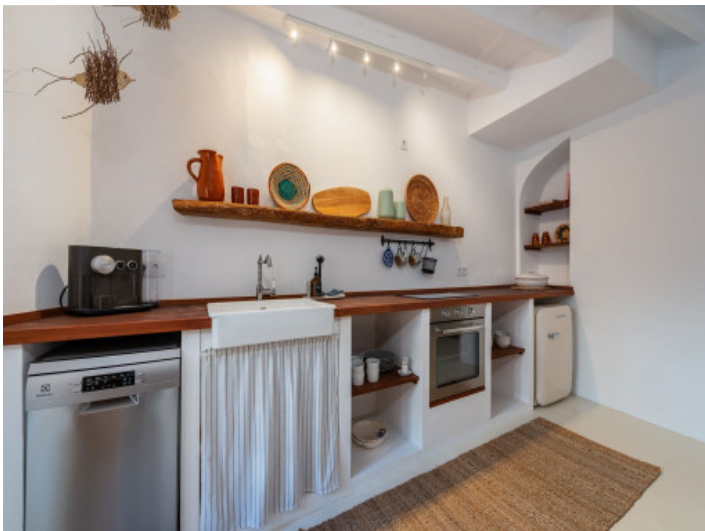
Mallorcan style kitchen