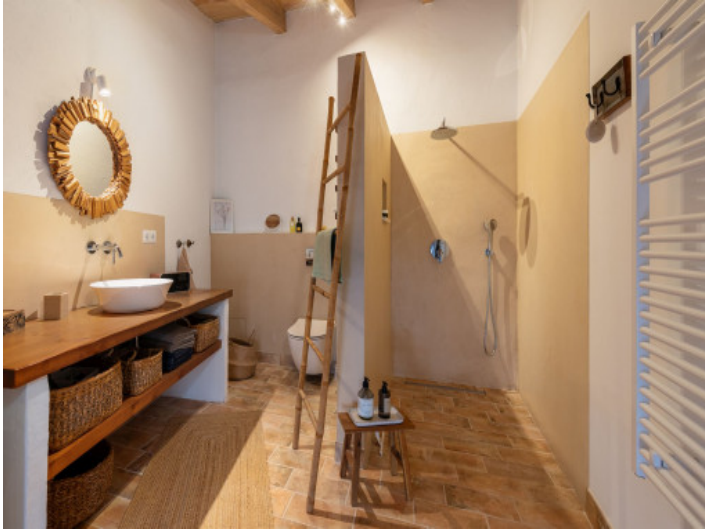
Enchanting shower bathroom