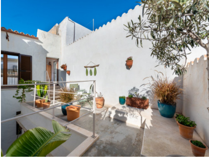
Alternative terrace view