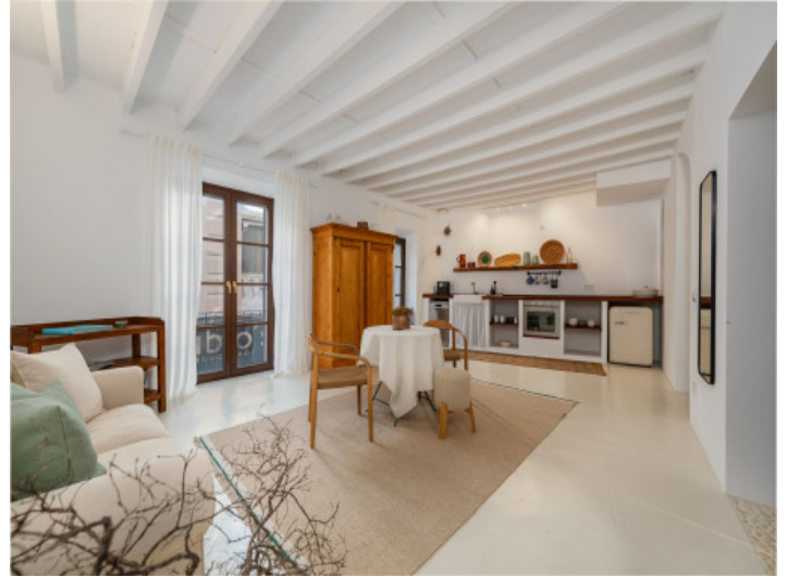
Second tastefully renovated apartment