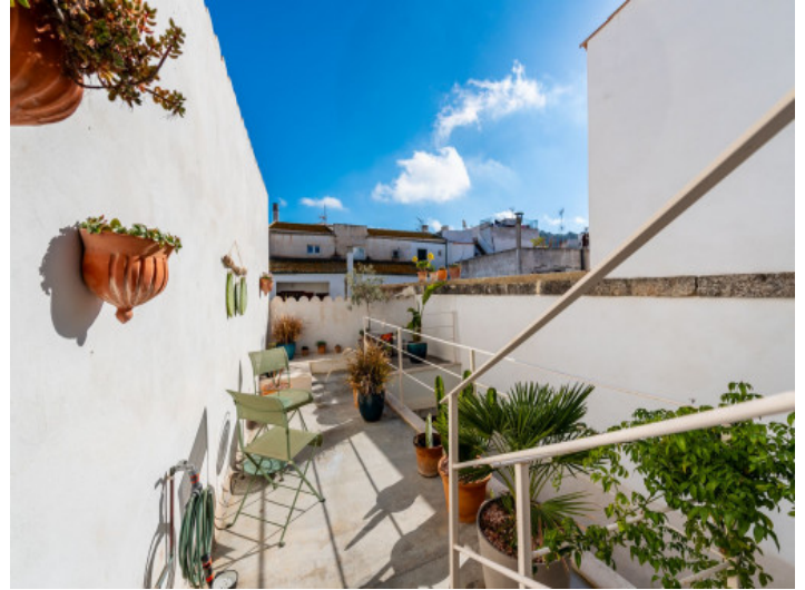
Lovely sun terrace