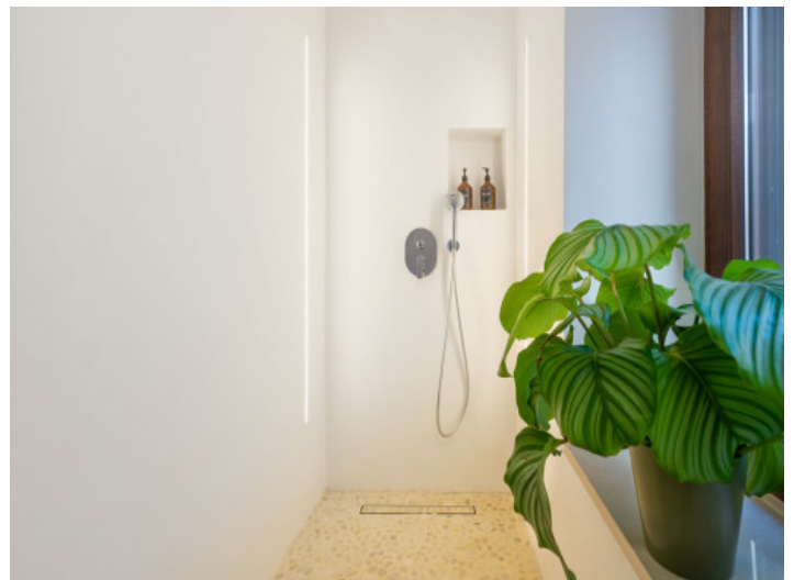
Modern shower bathroom

All information is correct to the best of our knowledge. Errors and prior sale excepted. This prospectus is purely for information purposes. Only the notarized deed of sale is legally binding.