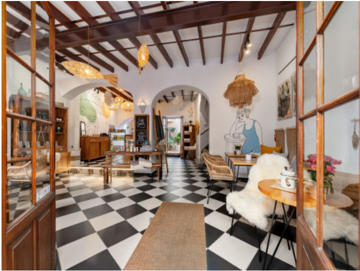
Attractive cafe on the ground floor