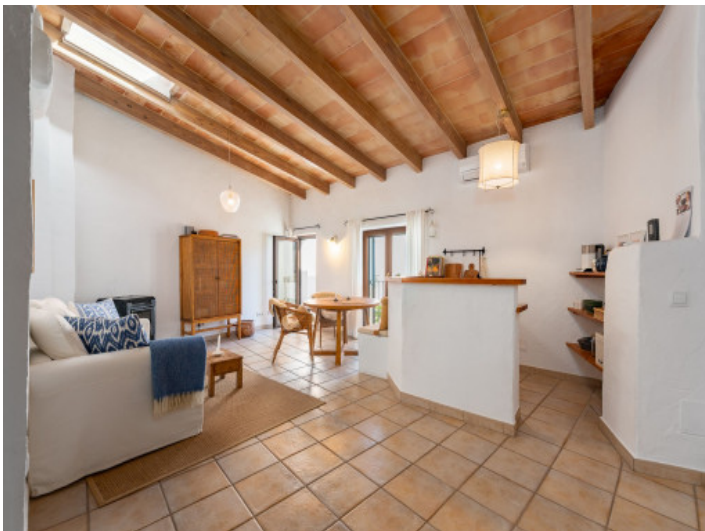
Access to a cosy apartment