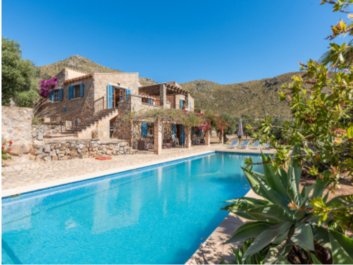
Pool area and facade