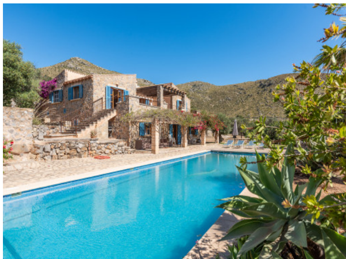
Pool area and facade