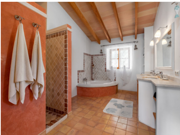
One of 4 bathroom