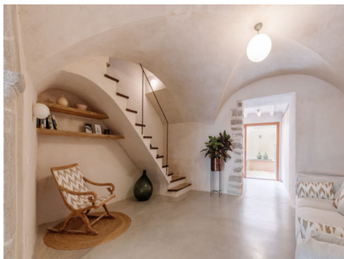
Entrance from the townhouse