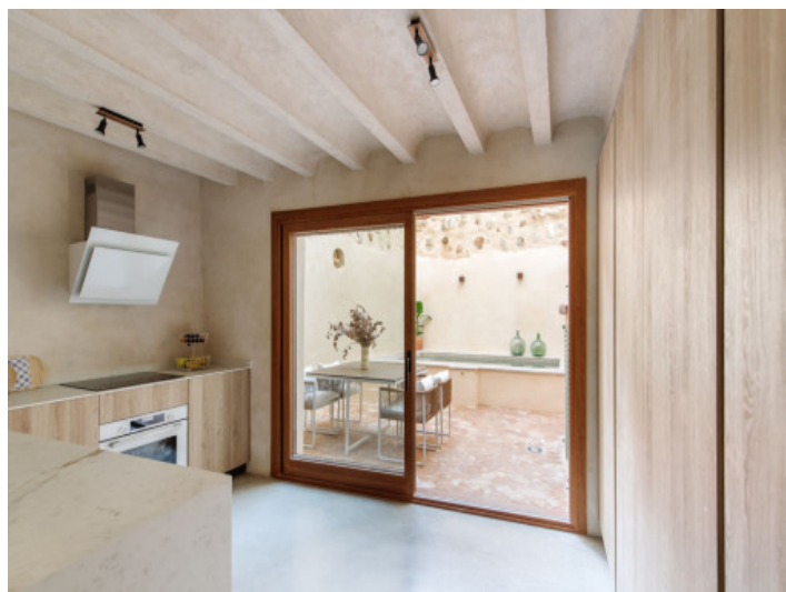
Kitchen with direct terrace access

All information is correct to the best of our knowledge. Errors and prior sale excepted. This prospectus is purely for information purposes. Only the notarized deed of sale is legally binding.