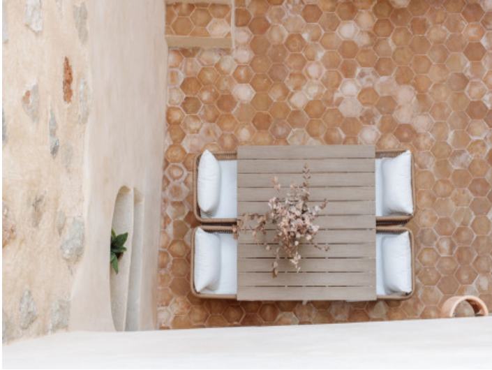
Tranquil area on the terrace

All information is correct to the best of our knowledge. Errors and prior sale excepted. This prospectus is purely for information purposes. Only the notarized deed of sale is legally binding.