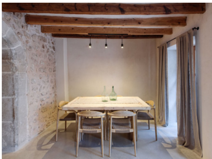
Dining area from the townhouse