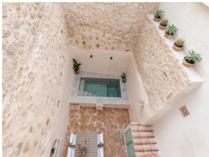
Patio with pool