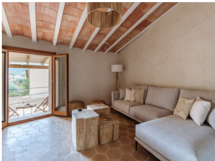
Beautifully renovated village house in the center of Alaró