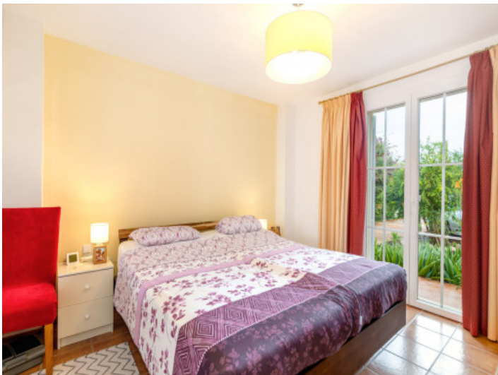
Bedroom with floor to ceiling windows