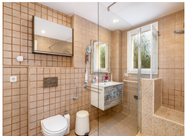
Bathroom with daylight

All information is correct to the best of our knowledge. Errors and prior sale excepted. This prospectus is purely for information purposes. Only the notarized deed of sale is legally binding.