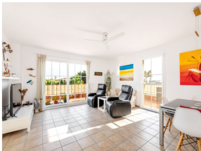
Light flooded living area on the upper floor

All information is correct to the best of our knowledge. Errors and prior sale excepted. This prospectus is purely for information purposes. Only the notarized deed of sale is legally binding.