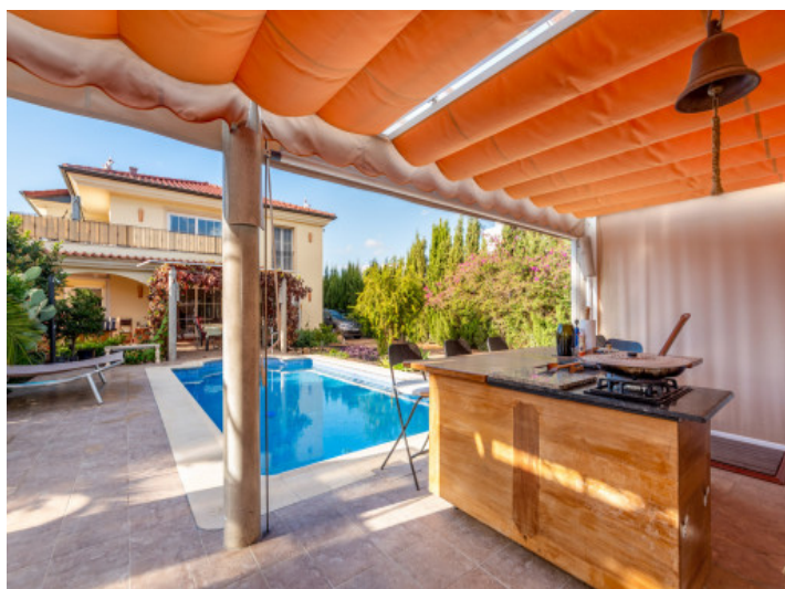
Covered summer kitchen