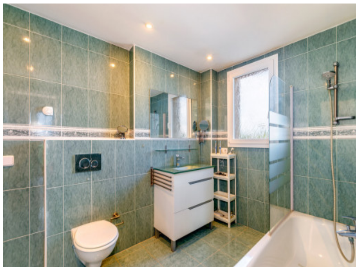
Bathroom with bathtub