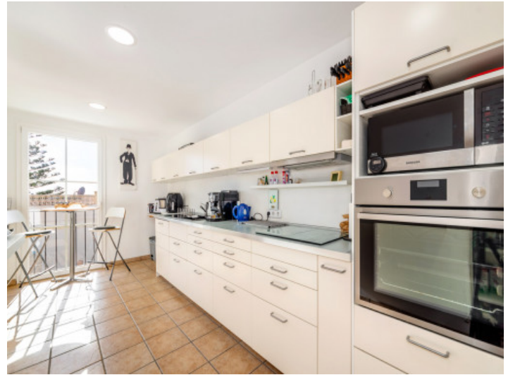
Kitchen on the upper floor