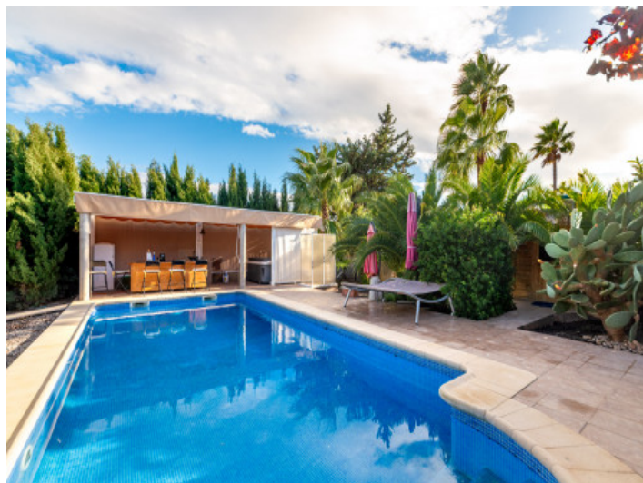
Views from the pool to the summer kitchen