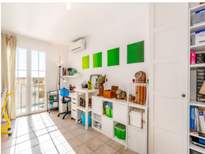
Office or children's room on the upper floor