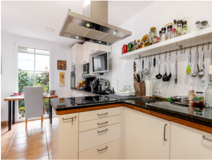
Fully equipped kitchen and dining area