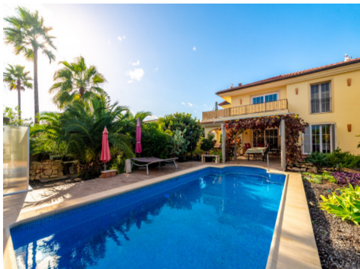
Well-tendet pool area