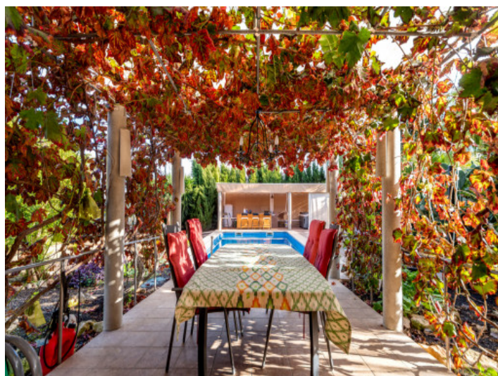
Idyllic outside dining area