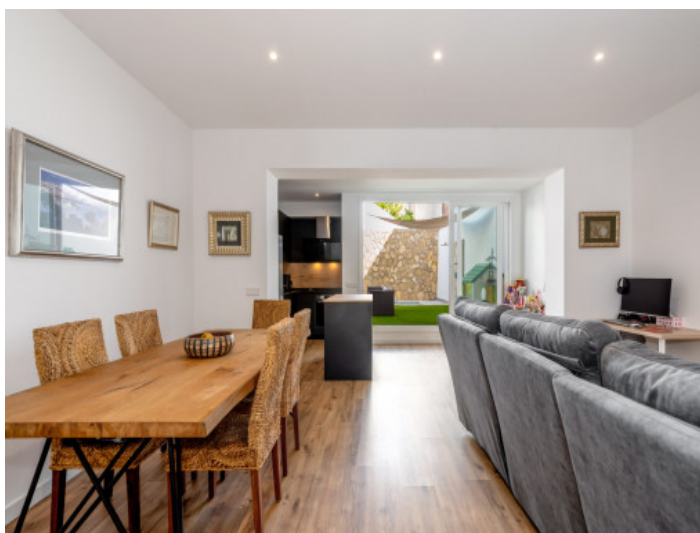
Bright living and dining area