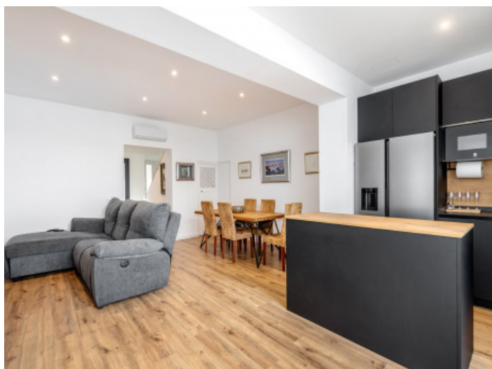
Open plan living area