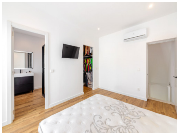
One of 2 bedrooms