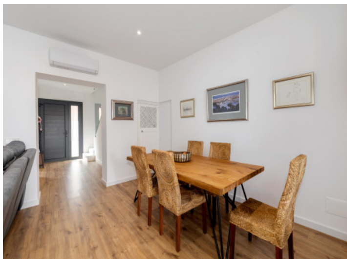
Elegant dining area