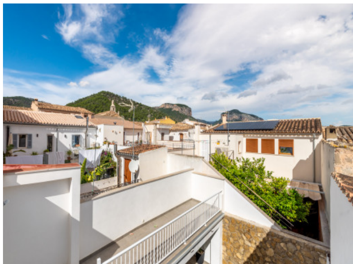
Lovely mountain views