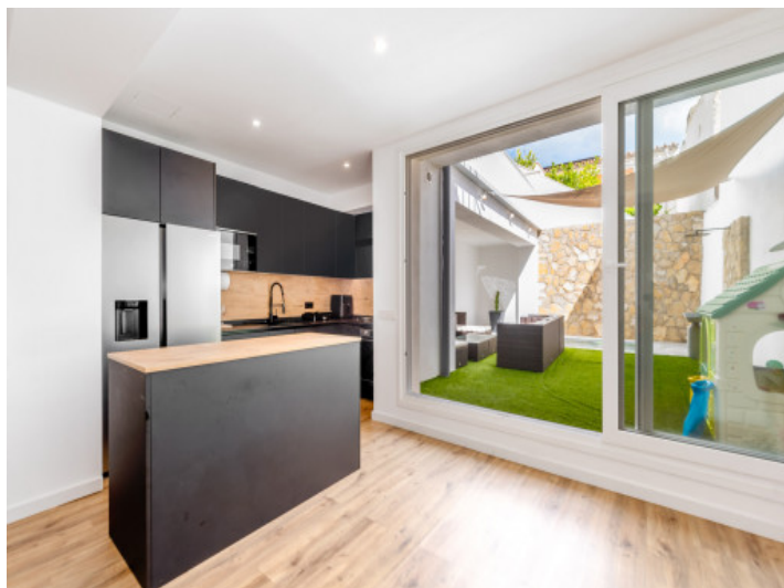
Kitchen with island and patio access