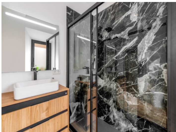
One of 3 bathrooms