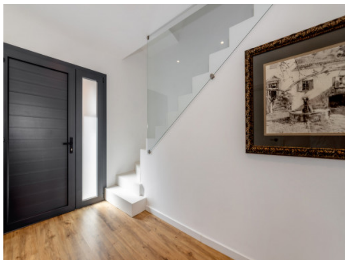
Modern entrance area

All information is correct to the best of our knowledge. Errors and prior sale excepted. This prospectus is purely for information purposes. Only the notarized deed of sale is legally binding.