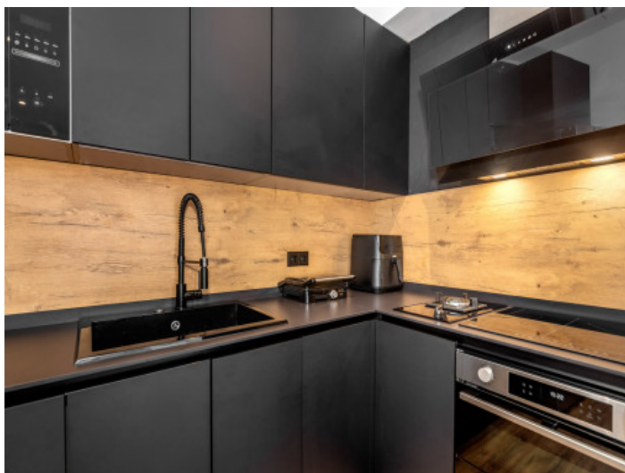
Modern fully equipped kitchen

All information is correct to the best of our knowledge. Errors and prior sale excepted. This prospectus is purely for information purposes. Only the notarized deed of sale is legally binding.