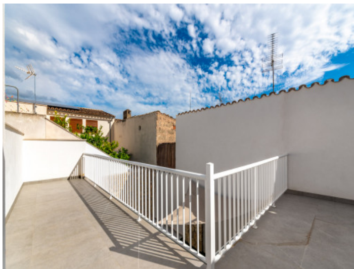
Large sunny terrace