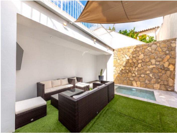
Private courtyard with outdoor dining area and pool