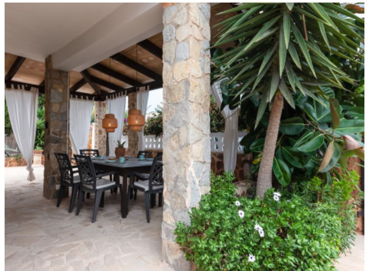
Covered terrace with dining table