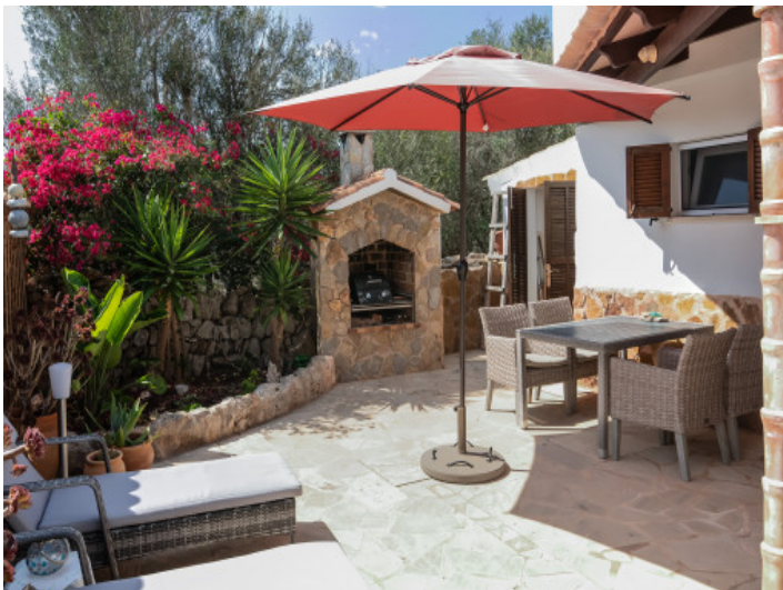
Outdoor dining area with barbecue