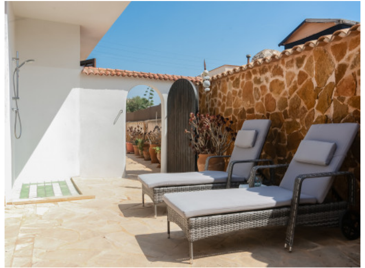
Sunny terrace with exterior shower