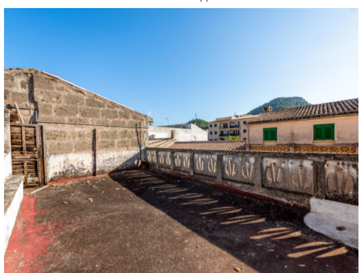
Large roof terrace