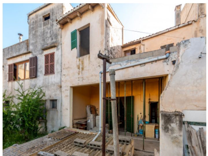
Rear side and terrace