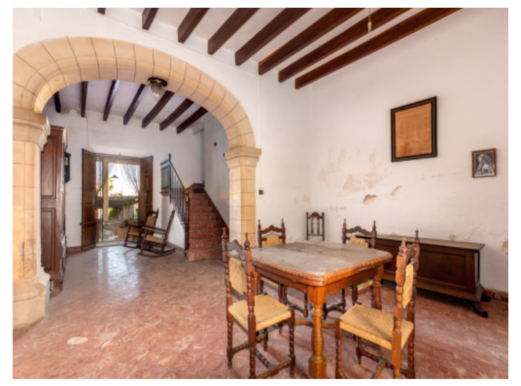
Townhouse in the centre of Son Servera with garden and terrace for