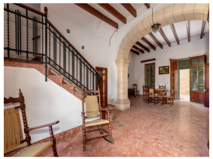
Mallorcan hall witth access to the upper floor