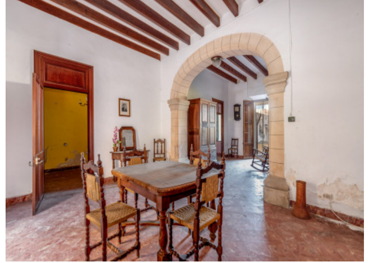
Dining area with traditional stone arch

All information is correct to ##foemation howledge. Errors and prior sale excepted. This prospectus is purely for information purposes. Only the notarized deed of sale is legally binding.