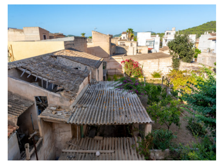
View over the garden