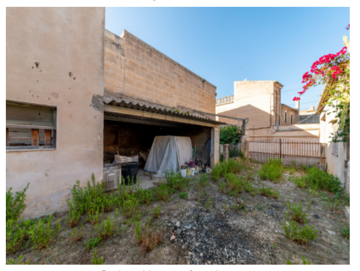
Garden with access from the street

All information is correct to the best of our knowledge. Errors and prior sale excepted. This prospectus is purely for information purposes. Only the notarized deed of sale is legally binding.