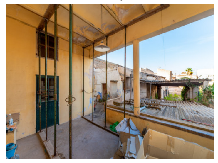
Partly covered terrace