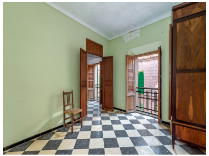
One of 4 bedrooms