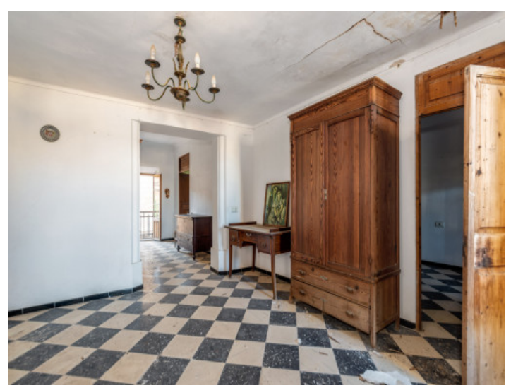
Bedroom on the upper floor