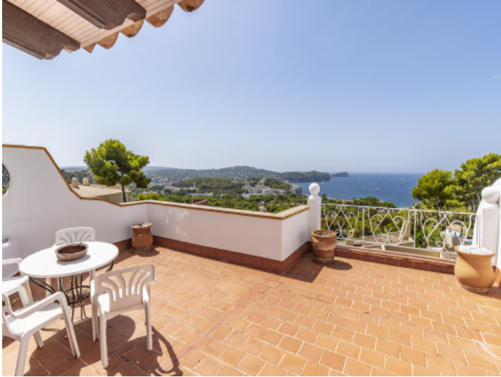
Terrace with sea views