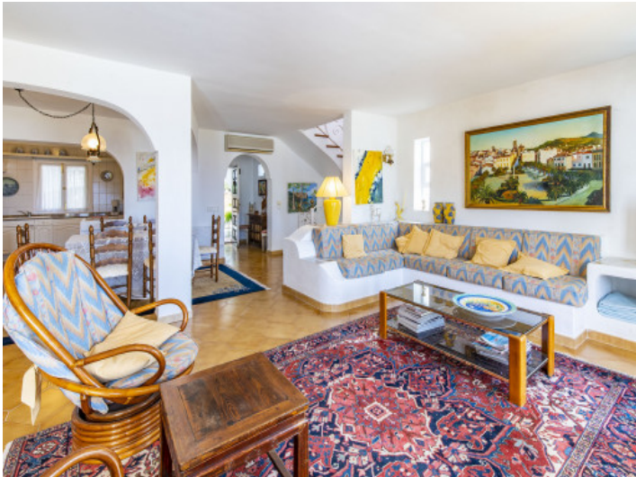
Living area with views to the floor