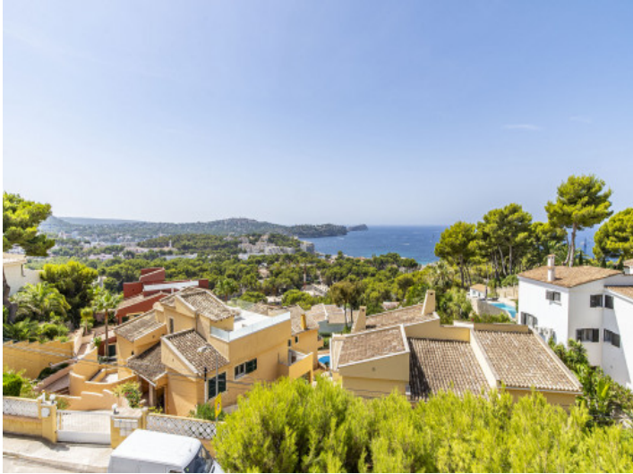
Unique mediterranean sea views