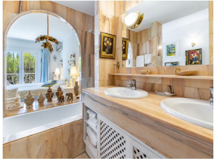
Bright bathroom with bathtub