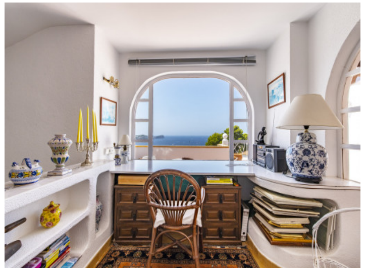
Office with sea views