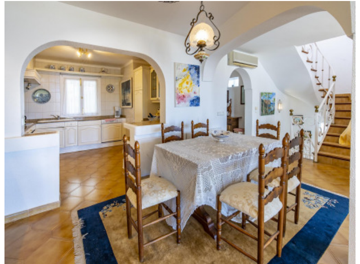
Views from the dining area to the kitchen