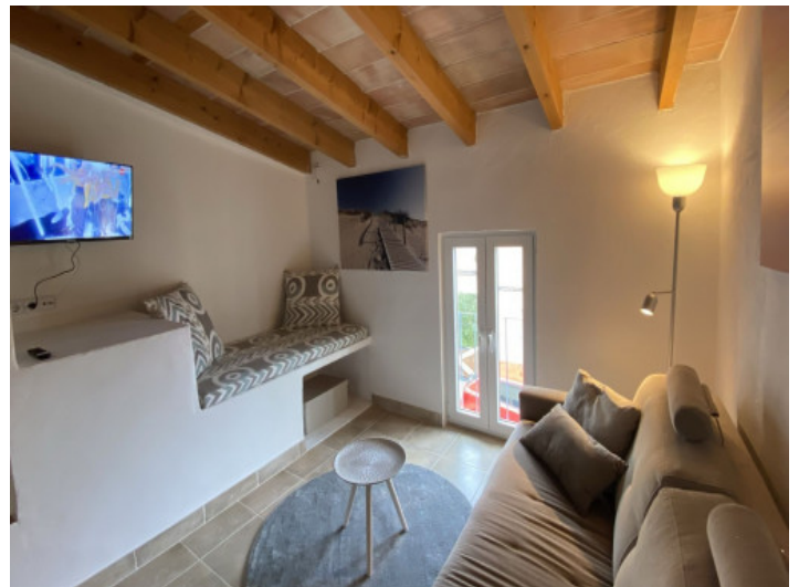
Further living room with fireplace

All information is correct to the best of our knowledge. Errors and prior sale excepted. This prospectus is purely for information purposes. Only the notarized deed of sale is legally binding.