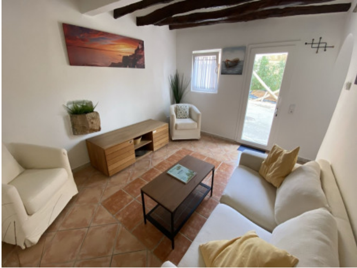
Living area on the ground floor