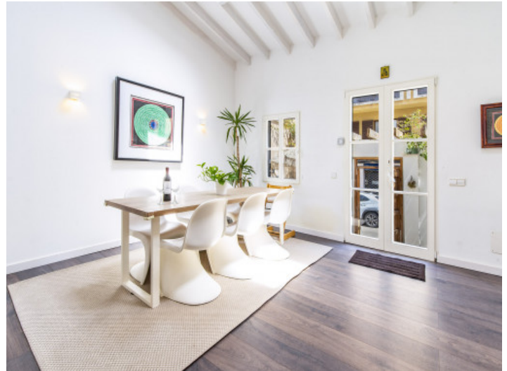
Light flooded dining area