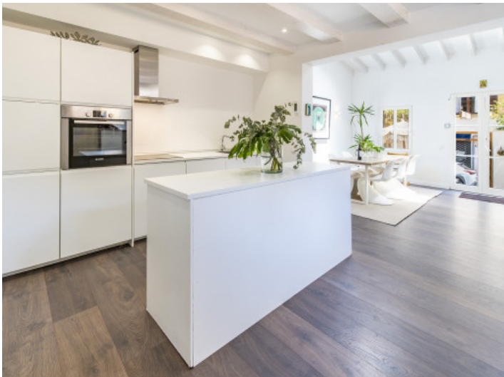
Modern, open kitchen