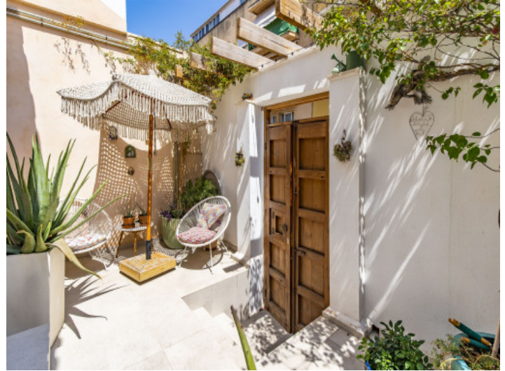
Mediterranean terrace and entrance door