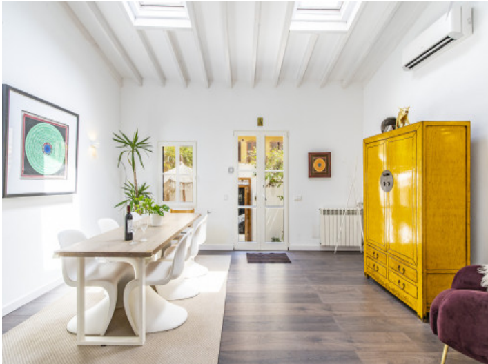
Beautiful dining area with access from the outside