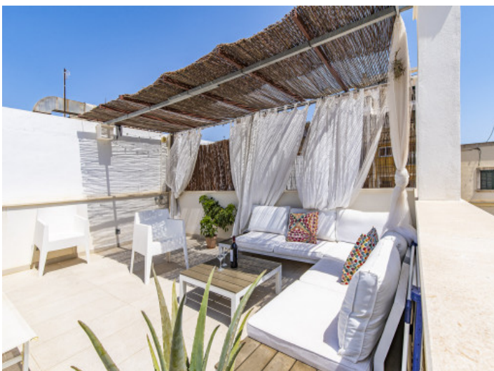
Cosy lounge area on the covered terrace