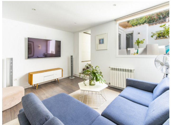
Cosy living area with access to a patio

All information is correct to the best of our knowledge. Errors and prior sale excepted. This prospectus is purely for information purposes. Only the notarized deed of sale is legally binding.