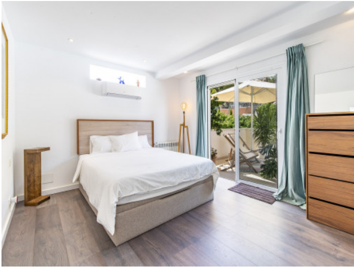
Bedroom with balcony access