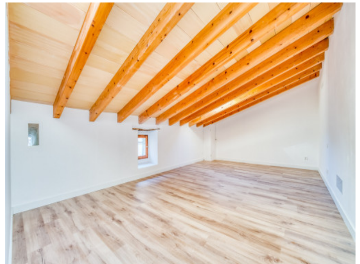
Light flooded bedroom