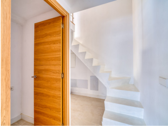
Staircase leads to the upper floor