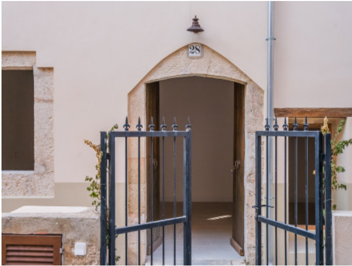
Entrance to the house