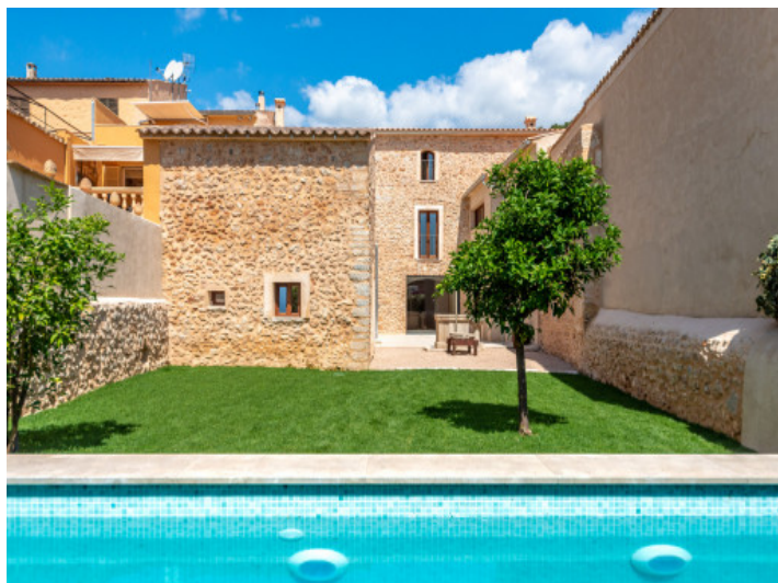
Townhouse with pool