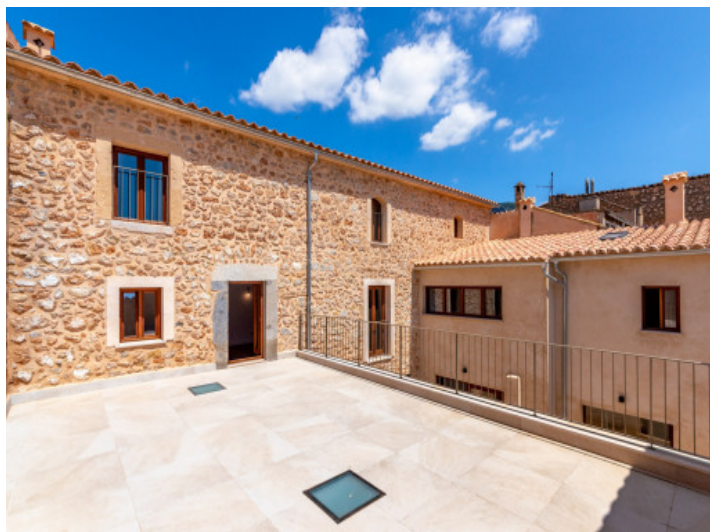
Large sun terrace