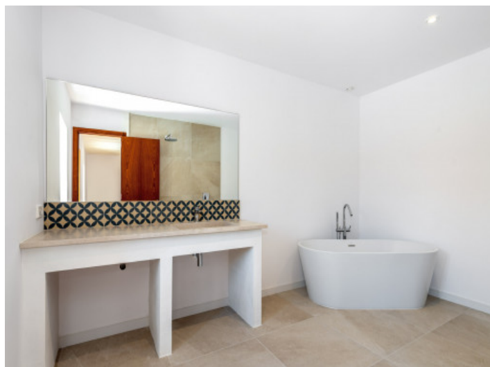
One of 6 bathrooms

All information is correct to the best of our knowledge. Errors and prior sale excepted. This prospectus is purely for information purposes. Only the notarized deed of sale is legally binding.