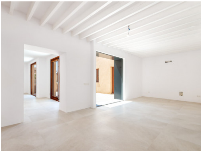
Open living area with patio access