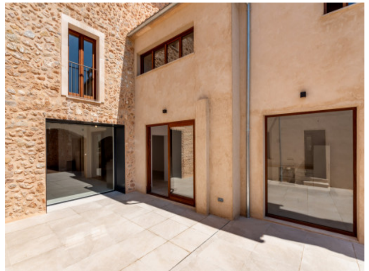
Large sunny inner patio