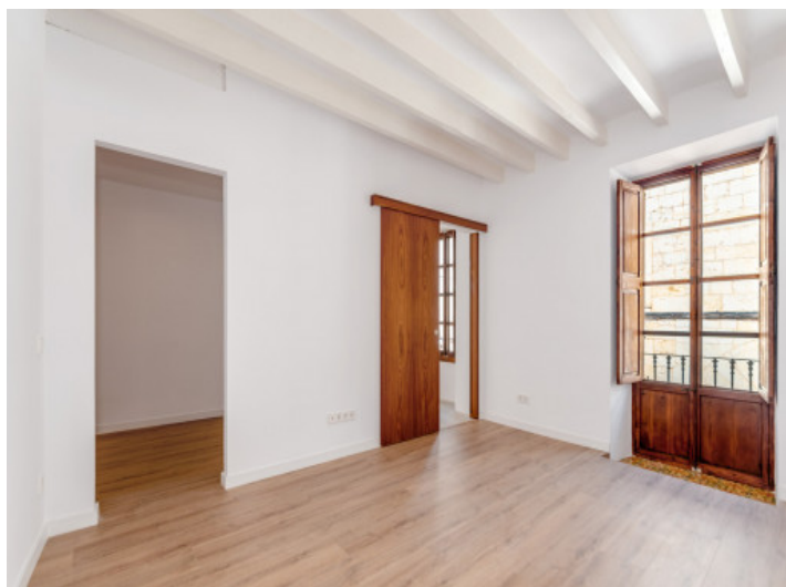
One of 5 bedroom