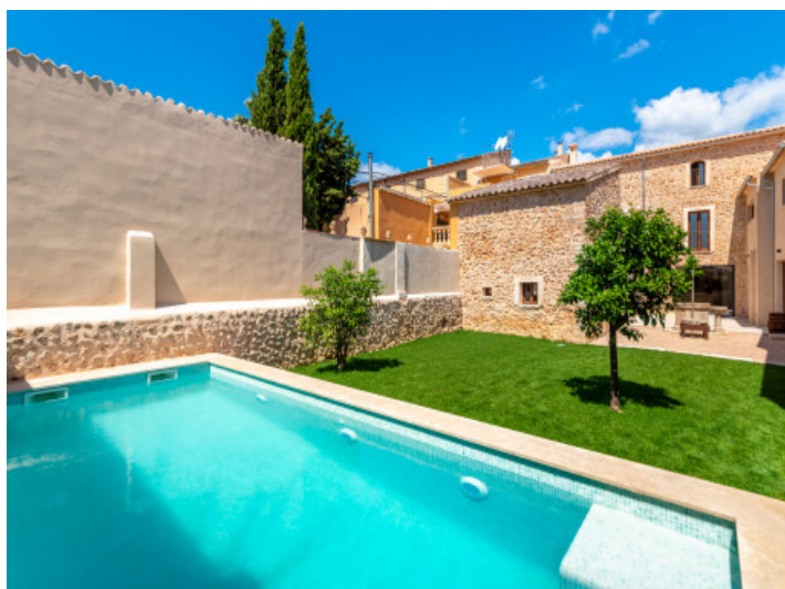
Sunny pool and garden area