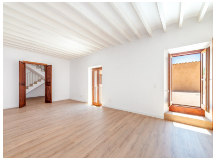
Upper floor with terrace access

All information is correct to the best of our knowledge. Errors and prior sale excepted. This prospectus is purely for information purposes. Only the notarized deed of sale is legally binding.