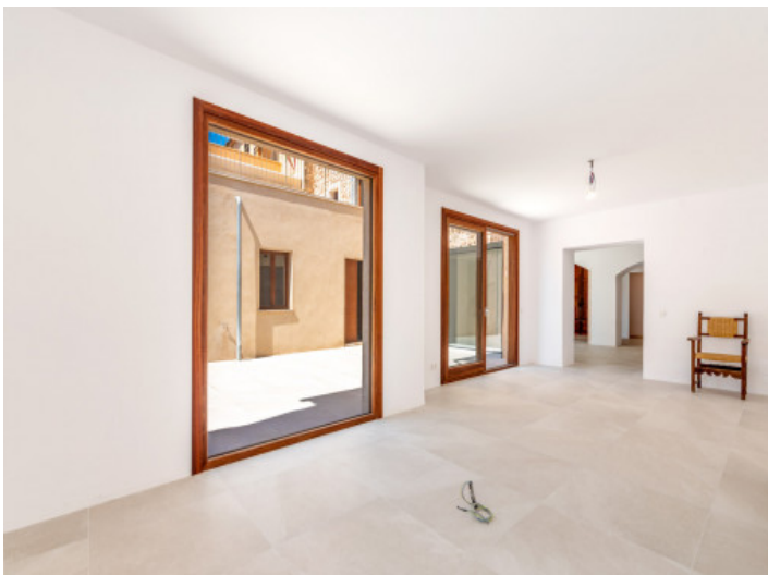
Patio access from another side