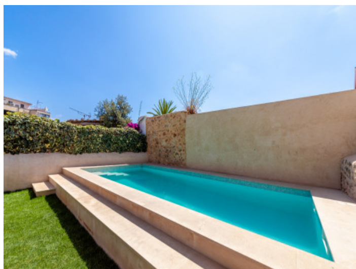
Relaxing pool area

All information is correct to the best of our knowledge. Errors and prior sale excepted. This prospectus is purely for information purposes. Only the notarized deed of sale is legally binding.