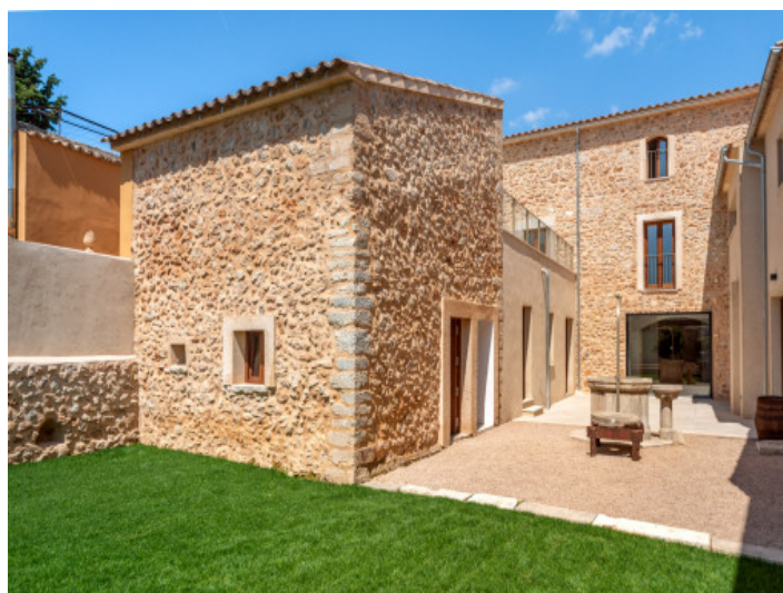
View of the house with terrace