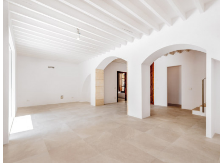
Living area with vaulted stone arches