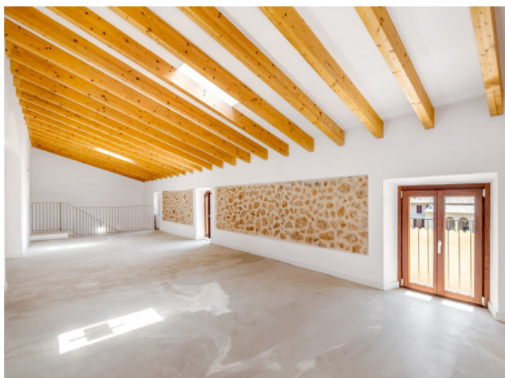
Beautiful wooden ceiling beams