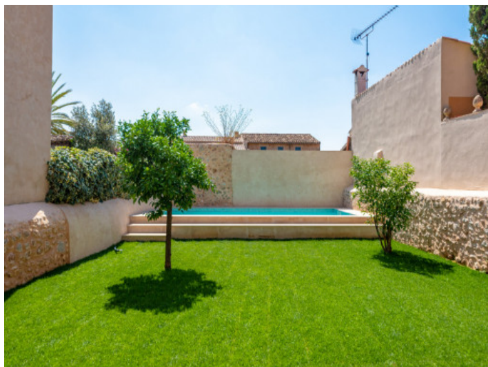
Beautiful garden with pool