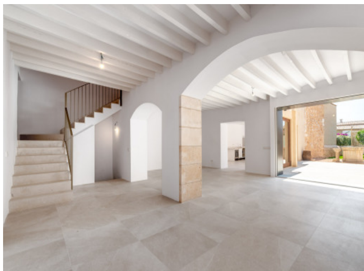
Living area with garden access