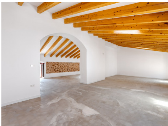
Large top floor