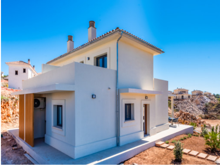
View to the house