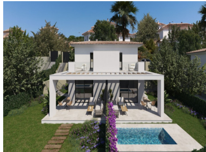
View to the house