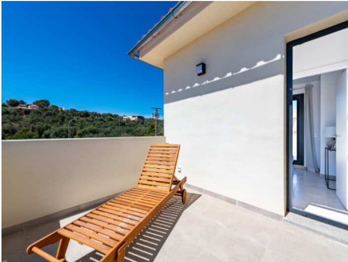
Terrace upper floor