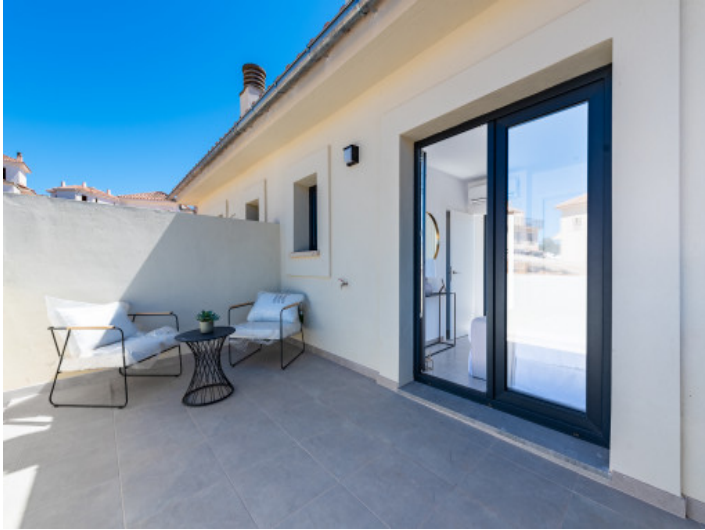
Terrace upper floor