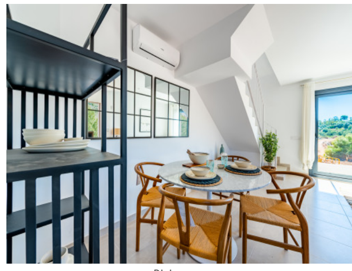
Living area Dining area All information is correct to the best of our knowledge. Errors and prior sale excepted. This prospectus is purely for information purposes. Only the notarized deed of sale is legally binding.

PORTA MALLORQUINA • C./ CONQUISTADOR 8, 07001 PALMA TEL. +34 971 698 242 • INFO@PORTAMALLORQUINA.COM