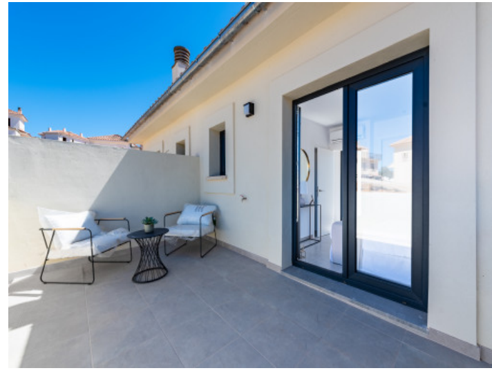
Terrace on the upper floor