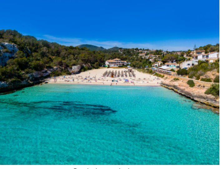
Beach close to the house