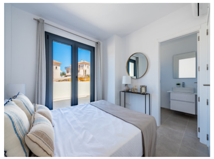
Masterbedroom with bath en suite