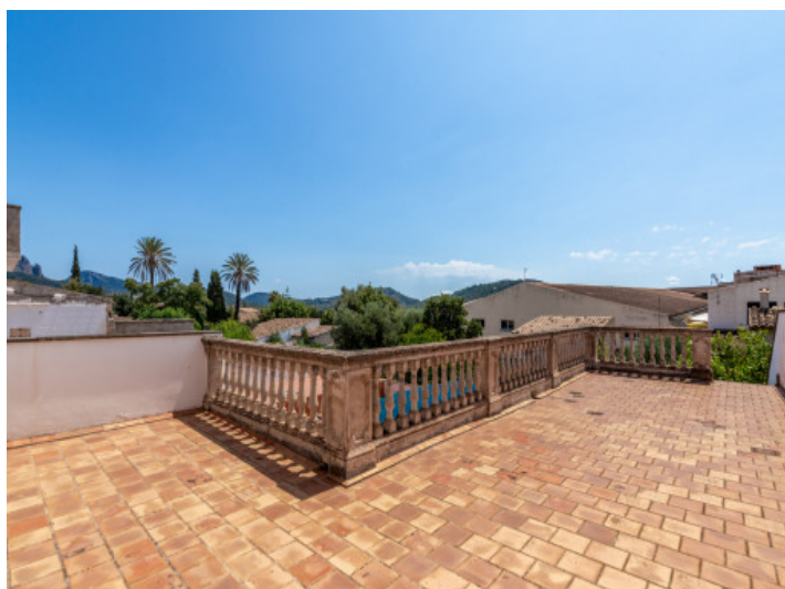
Large roof top terrace