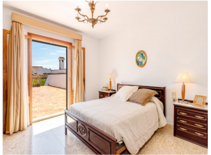
Bedroom with terrace