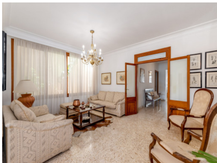
Separate living area

All information is correct to the best of our knowledge. Errors and prior sale excepted. This prospectus is purely for information purposes. Only the notarized deed of sale is legally binding.