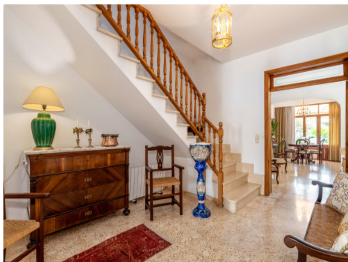
Floor and sitting area