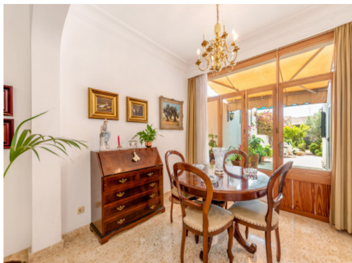
Dining area with access to the terrace

All information is correct to the best of our knowledge. Errors and prior sale excepted. This prospectus is purely for information purposes. Only the notarized deed of sale is legally binding.