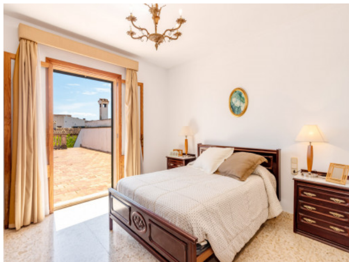
Bedroom with terrace