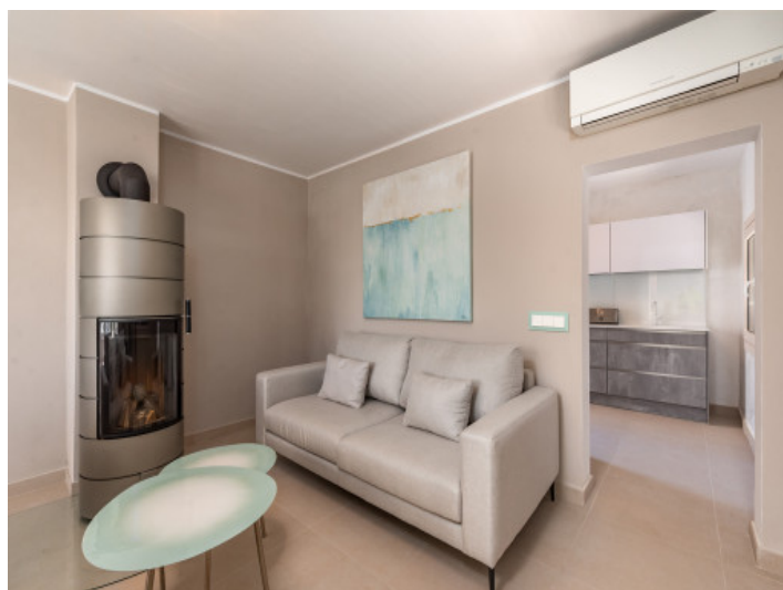
Living area adjacent to the kitchen