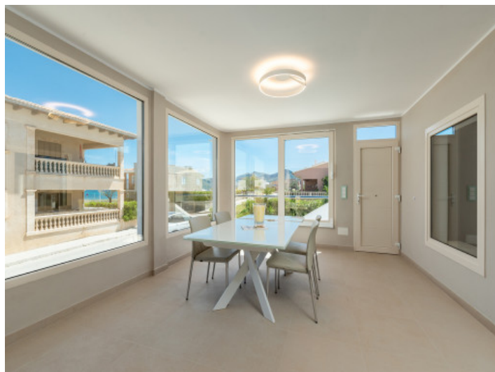
Dining area with panoramic views