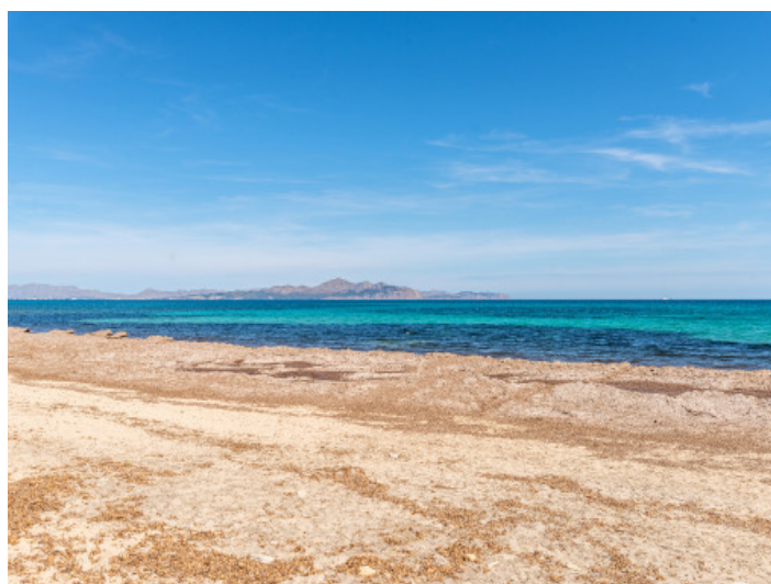
Walking distance to the beach

All information is correct to the best of our knowledge. Errors and prior sale excepted. This prospectus is purely for information purposes. Only the notarized deed of sale is legally binding.