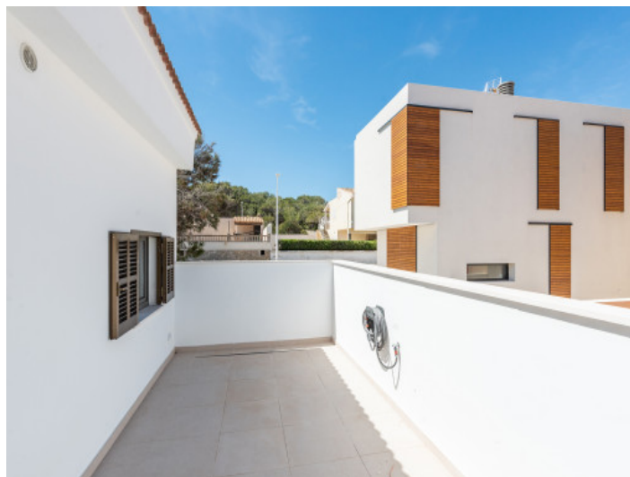
Spacious sunny terrace