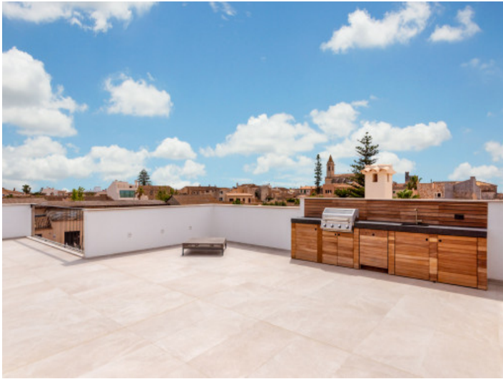
Roof terrace with outdoor kitchen