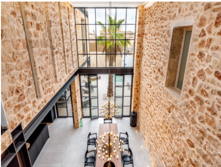
View from the upper level to the dining area