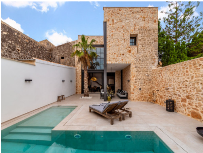
Views to the house, patio and pool