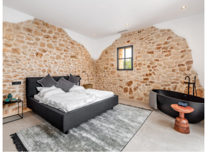
Bedroom with natural stone wall