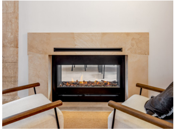
Details fireplace area