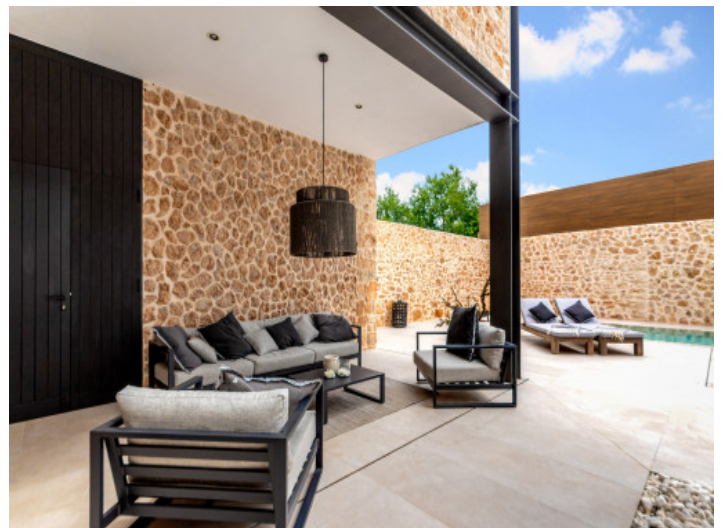
Terrace with lounge area

All information is correct to the best of our knowledge. Errors and prior sale excepted. This prospectus is purely for information purposes. Only the notarized deed of sale is legally binding.