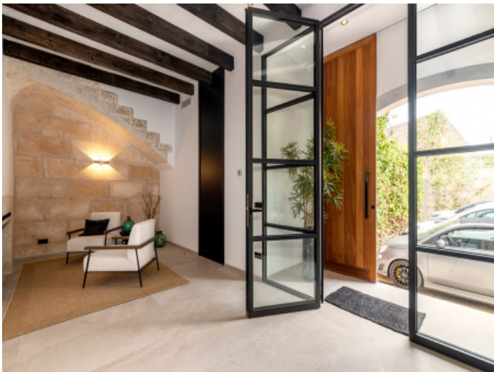
Entrance from the townhouse