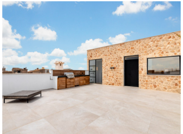
Spacious roof terrace