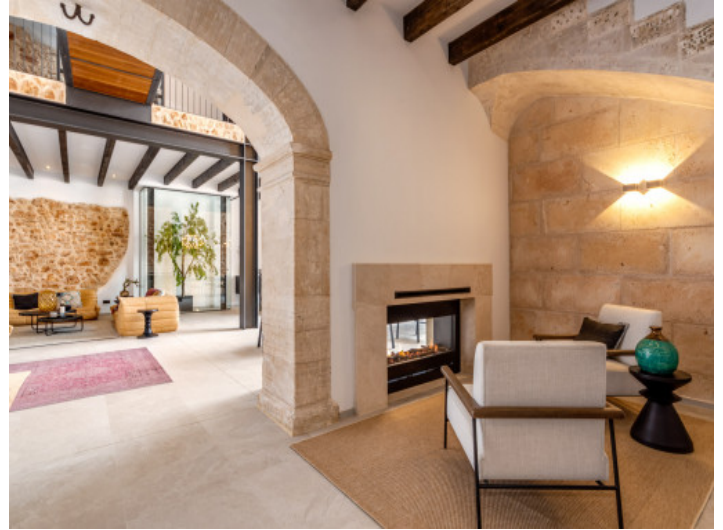
Fireplace area for cold winter days