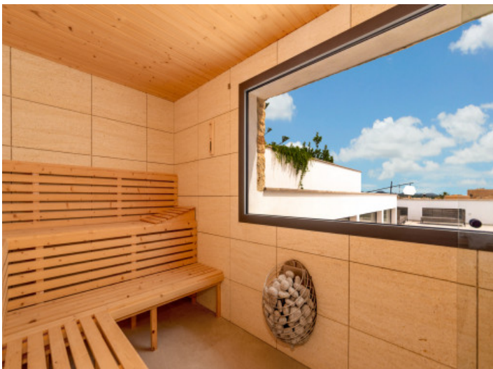
Sauna with views to the roof terrace