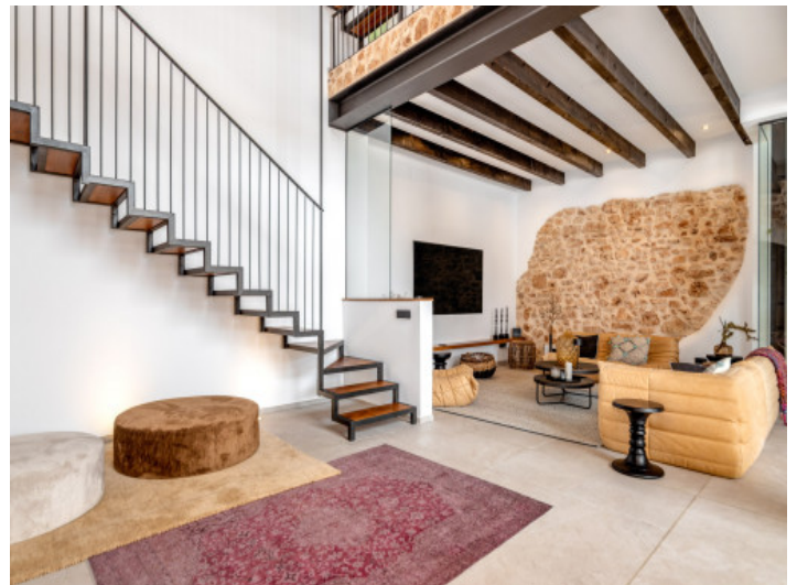
Access upper floor from the living area