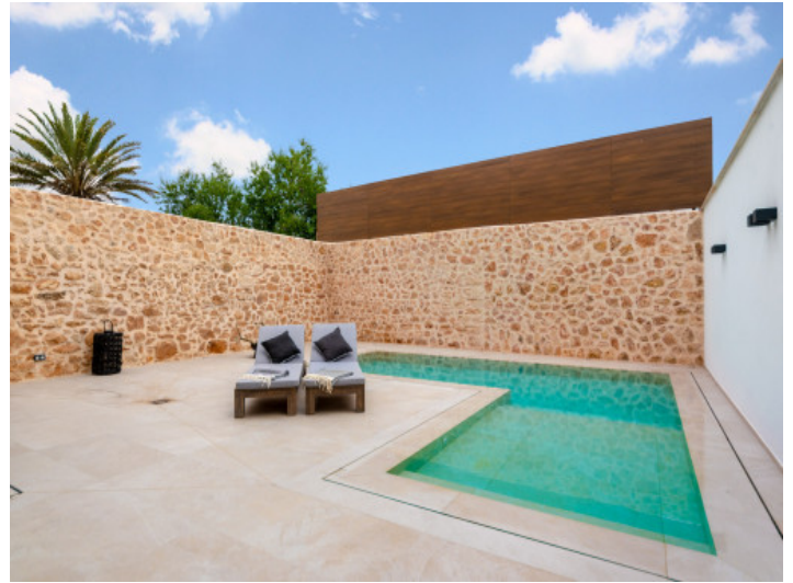
Pool area surrounded by a terrace