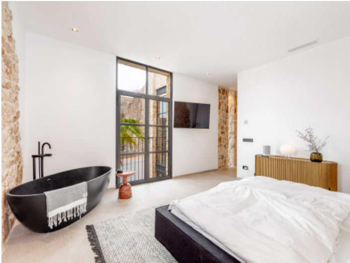
Bedroom with bathtub