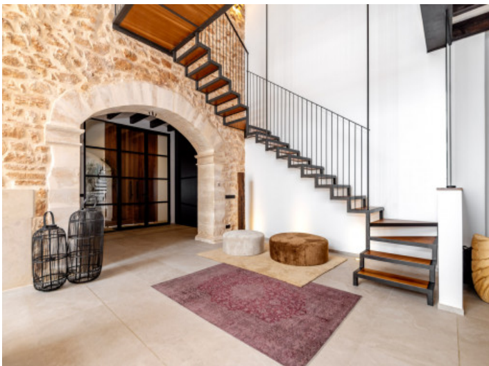
Acces upper floor