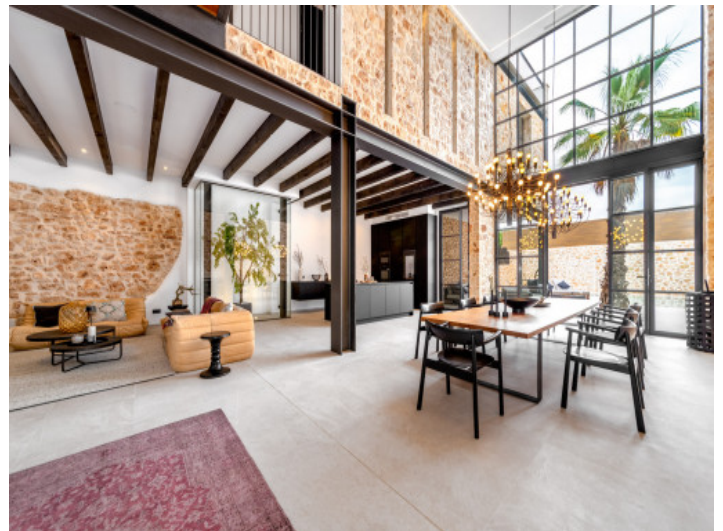
Light flooded living and dining area