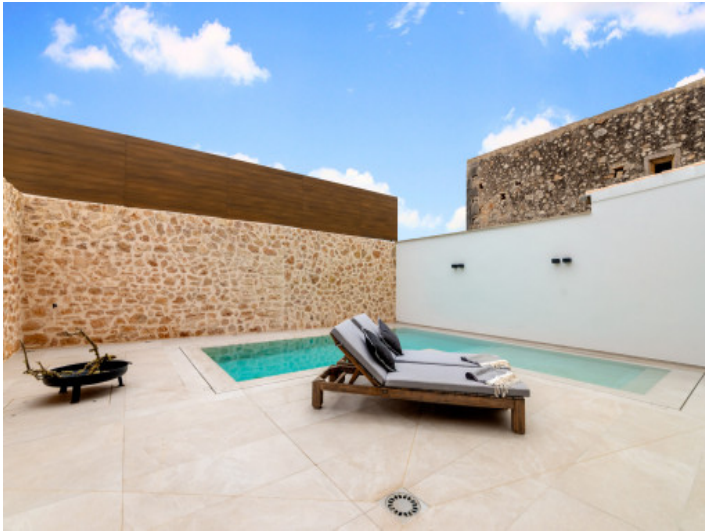
Pool area from the townhouse