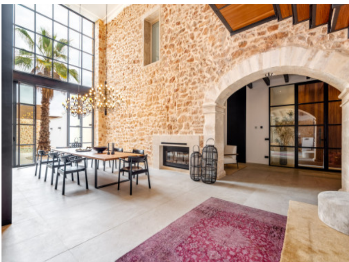
Dining area with fireplace