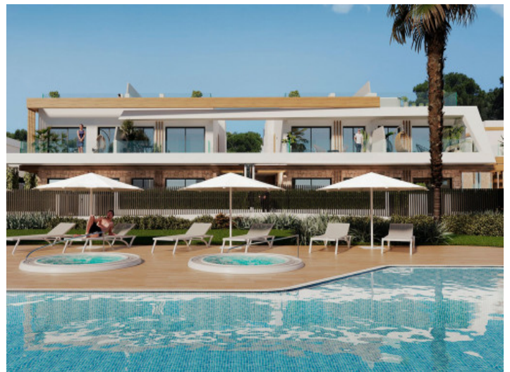
Community pool area with sun loungers

All information is correct to the best of our knowledge. Errors and prior sale excepted. This prospectus is purely for information purposes. Only the notarized deed of sale is legally binding.