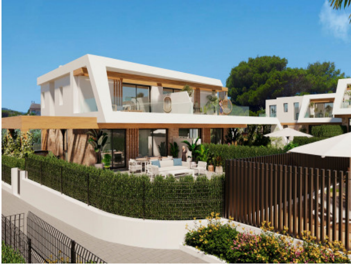
Semi-detached house with private pool in Cala Ratjada