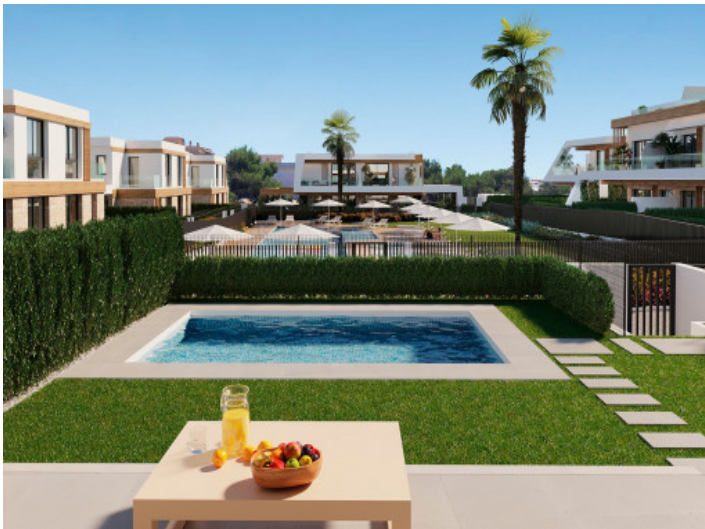
Semi-detached house with private pool in Cala Ratjada