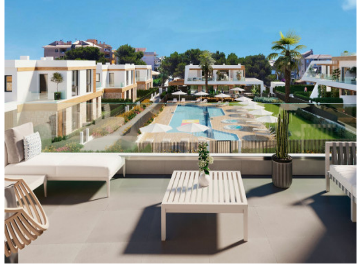
Balcony with chill-out area