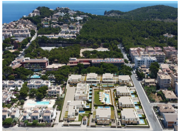
Surroundings of the residential complex

All information is correct to the best of our knowledge. Errors and prior sale excepted. This prospectus is purely for information purposes. Only the notarized deed of sale is legally binding.