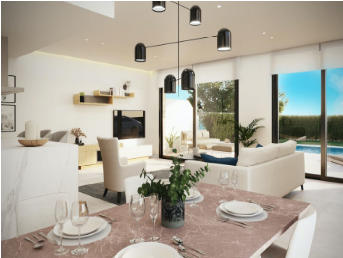
Light flooded living area