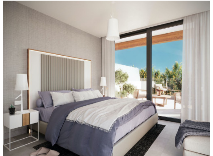
Another double bedroom with terrace