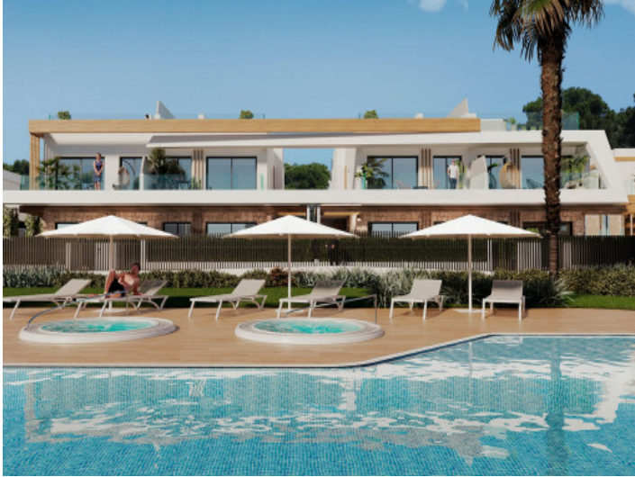
Community pool area with sun loungers