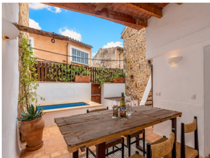
Patio and pool area