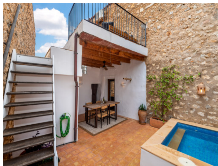
Patio and pool area