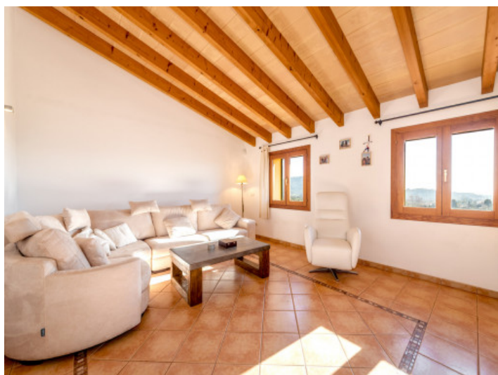
Upper living room