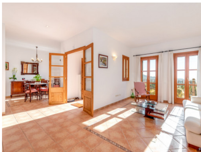
Light flooded living area