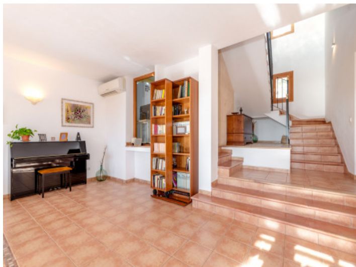
Living area and floor