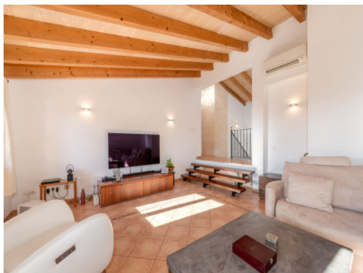
Upper living room