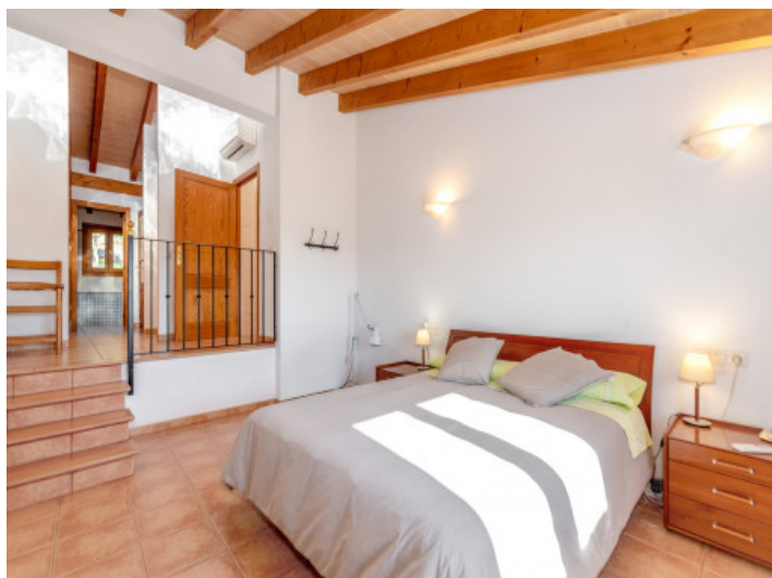
Master bedroom with wooden beams on the ceiling