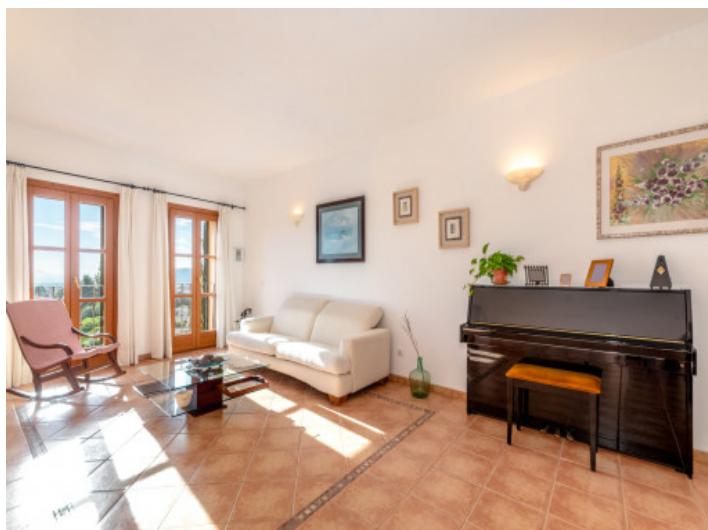
Light flooded living area