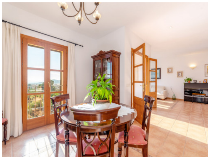
Dining and living area

All information is correct to the best of our knowledge. Errors and prior sale excepted. This prospectus is purely for information purposes. Only the notarized deed of sale is legally binding.