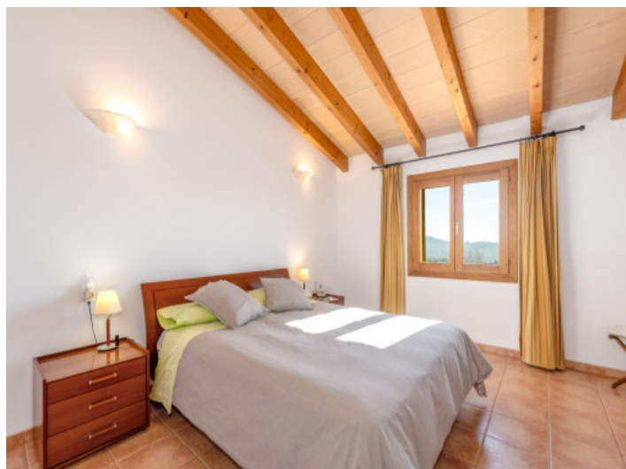
Alternative view of this bedroom

All information is correct to the best of our knowledge. Errors and prior sale excepted. This prospectus is purely for information purposes. Only the notarized deed of sale is legally binding.