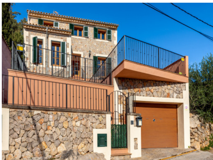
Beautiful natural stone facade